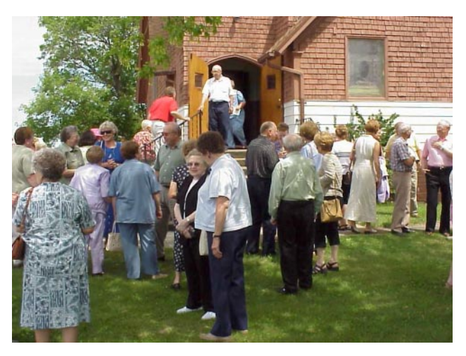
Friends from near and far gather at the church for the daylong Bowesmont reunion.

In April 1997, the worst flood of all robbed Bowesmont of its last breath. Residents, already weary from a flood the year before, had petitioned the county for a government buyout of their damaged homes. But before that buyout could occur, the raging Red River smacked them again. Now there really was no doubt. Bowesmont would never recover. Or so it seemed.