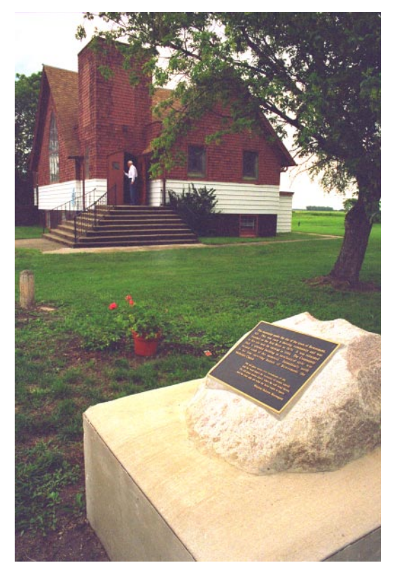
A historical marker and the Methodist church mark the spot where the town of Bowesmont once lived.

What makes this reunion so unique is that Bowesmont doesn't really exist anymore... physically that is. The houses and buildings that made up this little town in the northeastern corner of the state are all gone. Now, grassy fields and a few narrow dusty roads keep a silent vigil. The lone survivors are the Methodist Church and, about half a mile up the road, the Bowesmont Cemetery.