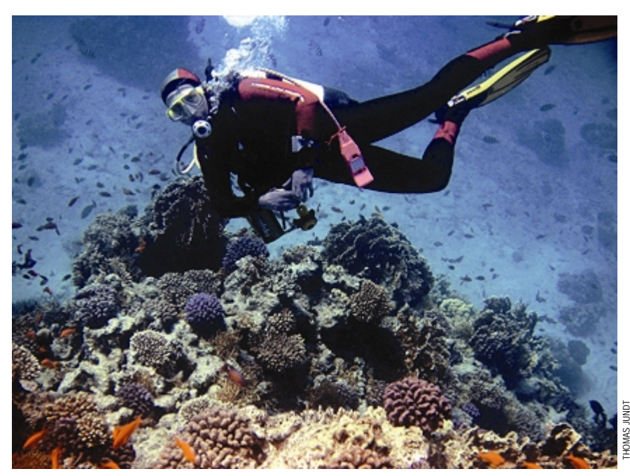
Diving among the coral in the Red Sea (Egypt)

The Sri Lanka Competitiveness Initiative (Annex 2.H) is a broad-based program working with several industry clusters including ceramics, coconut fiber, jewelry, and tourism. The tourism cluster was