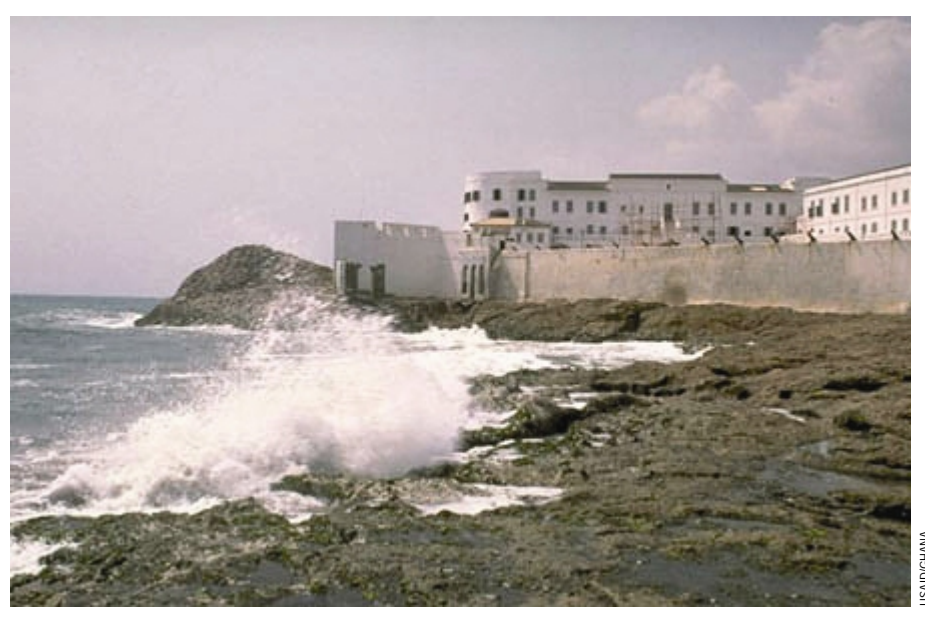
A former slave trading fort in Ghana

The term "sustainable tourism" can mean different things to different people, often according to the perspective of the individual stakeholder. The private tourism industry views it largely in economic and marketing terms: How can the tourism market be sustained and grow in the long term? The local community may see it in terms of socioeconomic benefits and cultural preservation: How can tourism help sustain a community and its culture rather than degrade them?