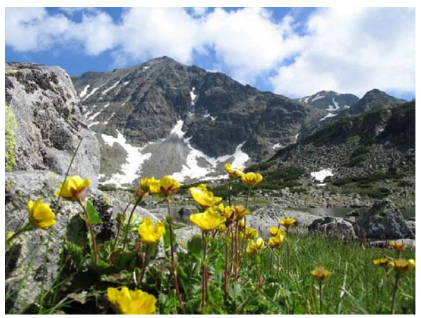
Alpine meadow and mountains in Bulgaria

Whether domestic or international in origin, projected increases in tourism over the coming decades will have a significant impact upon destinations, contributing to economic development, but also to consequent deterioration of natural systems and their protective functions. In many places around the world, the Agency's focus has already moved towards remediation and mitigation of adverse impacts to the environment, as well as to pollution prevention and clean technologies. For example, Integrated Coastal Management (ICM) is being utilized to help restore impaired nearshore environments, often using