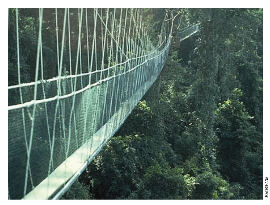
A walkway connects a rainforest canopy in Ghana

The Central American Paseo Pantera ("Panther Walk") has helped establish national nature tourism councils in Guatemala and Honduras to involve local communities and tourism enterprises. The councils also enlist international conservation organizations as advisors to promote green, self-sustaining tourism activities.