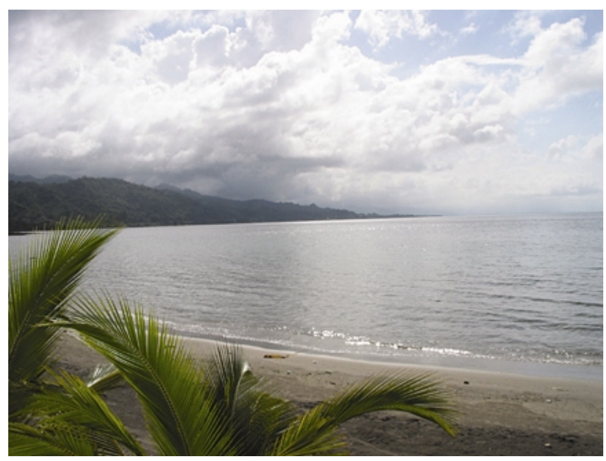
Coastal landscape in Honduras

Poorly planned tourism can be extremely destructive to its surrounding environment, cultures and economies. Overdependence on any single industry is risky to a local economy, potentially leading to marked seasonal fluctuations and longer term downturns. Undertaken wisely, and carefully guided from project diagnosis through design and implementation, tourism's multifaceted attributes can be woven to support many different Agency programs and objectives. With the increase in projected tourist travel over the next decade, however, even greater attempts will need to be made to ensure that the natural and