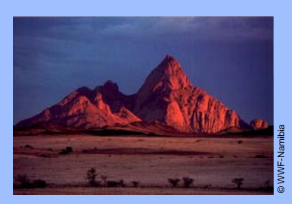
Spitzkoppe Mountain, known as the "Matterhorn of Namibia"

In 1993, with support from USAID and the World Wildlife Fund, new legislation allowed communities rights over wildlife provided that community members could meet the standards to register as a conservancy (a type of community-based management institution). Once a conservancy was established, the community received assistance in adopting effective game management practices, negotiating with the private sector, and benefiting from tourism revenues.