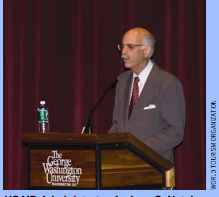
USAID Administrator Andrew S. Natsios presented USAID's approach to sustainable tourism, noting the importance of community involvement and capacity building.

The first of its kind, the conference brought together representatives from donor agencies, developing countries, and civil society to discuss how sustainable tourism can help fuel economic growth in developing countries. It attracted more than 400 participants and observers from 52 countries, including 20 tourism ministers or top-level government officials.