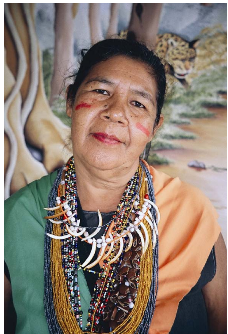
An indigenous woman in Colombia

Tourism-related activities have been instrumental in advancing USAID's strategic objectives of gender equity and promoting women's role in the development process. For example, in Tanzania, a group of village women formed the Naisho Women's Group ("naisho" means "increase" or "multiply" in Maasai) to work toward preserving their culture and alleviating gender inequality and poverty. Seeking to capitalize on a newly paved road to a wildlife corridor, Naisho established the Esilalei Cultural Boma in 1999 to bring dollars to the village. In 2001, USAID and the African Wildlife Foundation (AWF) began working with Naisho on community-based approaches to natural resources management. The women were trained to diversify and raise the quality of their handicrafts. In 2003, an Agency-funded permanent hut for handicraft sales was opened. As a result, Naisho's annual income increased sharply from $400 in 2001 (when USAID support began) to