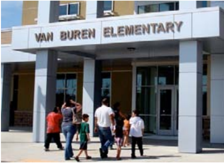
Van Buren Elementary School, located in the Caldwell School District, is an energy-efficient building that educators use as a teaching tool for raising awareness about energy efficiency among students.

Energy Empowers is a U.S. Department of Energy clean energy information service. Our team produces stories featuring the people and businesses that are fueling the energy transformation and economic recovery in America. For more stories from your state, go to energyempowers.gov/Idaho