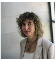
Dr. Allison Macfarlane George Mason University