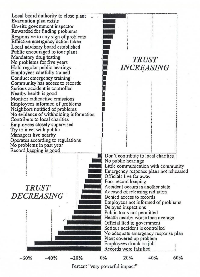
Figure 12. Differential impact of trust-increasing and trust-decresing events. Note: only percentages of Category 7 ratings (very powerful impact) are shown here.