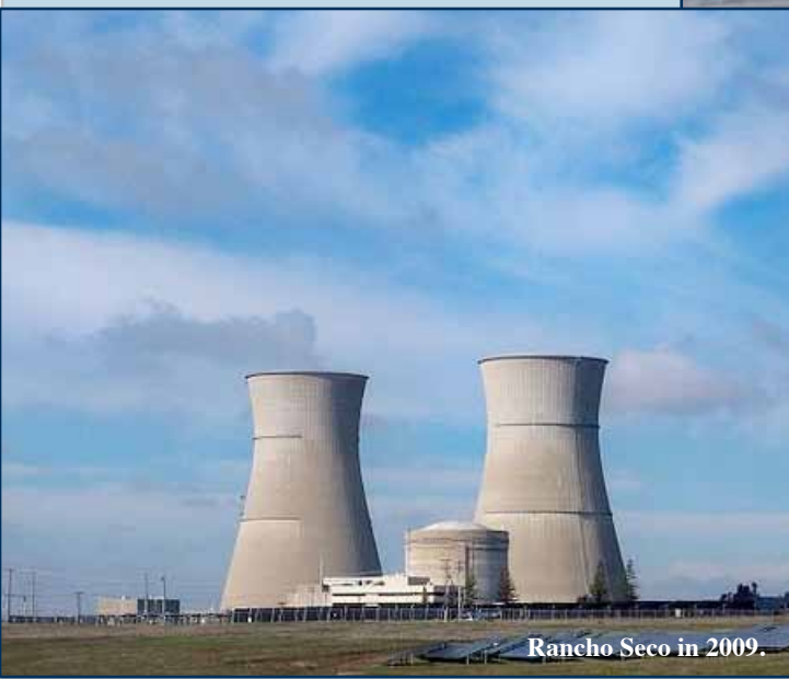
Rancho Seco in 2009.

The plant, owned by the Sacramento Municipal Utility District (SMUD), permanently shut down on June 7, 1989, due to public referendum. The nuclear reactor was defueled later that year and physical decommissioning began in January of 1997. By mid-2000 work was underway to dismantle the reactor building equipment and spent fuel pool, and construction began on a new 500-megawatt gas-fired plant on Rancho Seco property. Physical decommissioning was completed in December 2008.