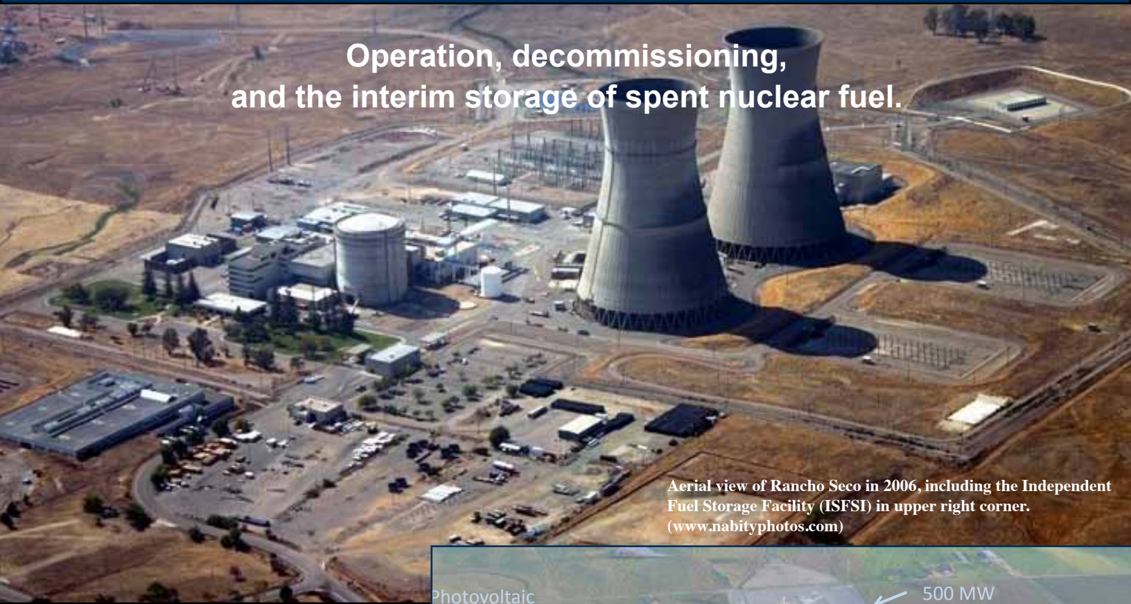
Aerial view of Rancho Seco in 2006, including the Independent Fuel Storage Facility (ISFSI) in upper right corner.

Operation, decommissioning, and the interim storage of spent nuclear fuel.