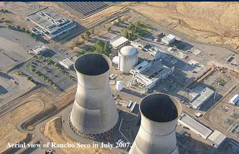
Aerial view of Rancho Seco in July 2007.

Fuel transfer from the pool to the ISFSI was completed in August 2002. Over a period of 16 months, the spent fuel was loaded into 21 dry storage canisters and transported to the ISFSI. On August 22, 2006, the canister containing Greater than Class C waste (GTCC), irradiated steel removed from the reactor vessel, was loaded into the twenty-second Horizontal Storage Module and transferred to the ISFSI. A total of 493 spent fuel assemblies were placed at the ISFSI, including 13 damaged assemblies. SMUD was the first utility in the world to load damaged fuel assemblies in dry storage containers.