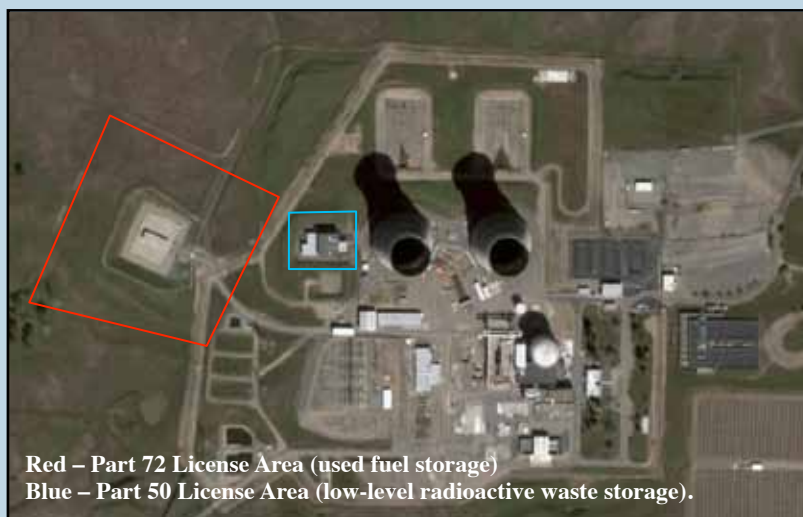
Red - Part 72 License Area (used fuel storage) Blue - Part 50 License Area (low-level radioactive waste storage).

The approximate gross cost of Rancho Seco's decommissioning was $498.8 million, which included all dismantlement and decontamination costs, as well as the cost of construction of the ISFSI, and transfer of used nuclear fuel and GTCC waste into the ISFSI for storage.