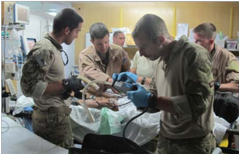
Preparing an injured contractor for transport from a coalition hospital in Herat, Afghanistan.

The extensive use of contractors obscures the full human cost of war. The full cost includes all casualties, and to neglect contractor deaths hides the political risks of conducting overseas contingency operations. In particular, significant contractor deaths and injuries have largely remained uncounted and unpublicized by the U.S. government and the media.