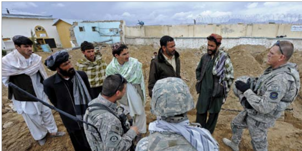
Provincial Reconstruction Team members with Afghan contractors at hospital expansion site.

The number of Defense acquisition professionals declined by 10 percent during a decade that saw contractual obligations triple.