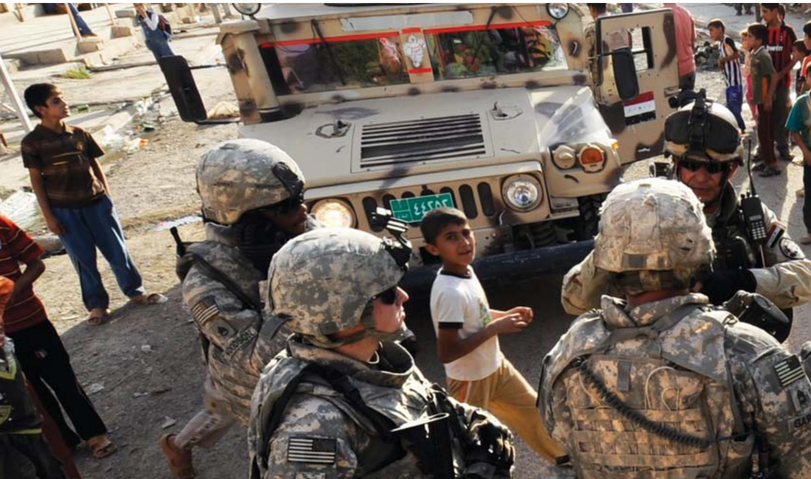
U.S. and Iraqi soldiers, Mosul, Iraq.