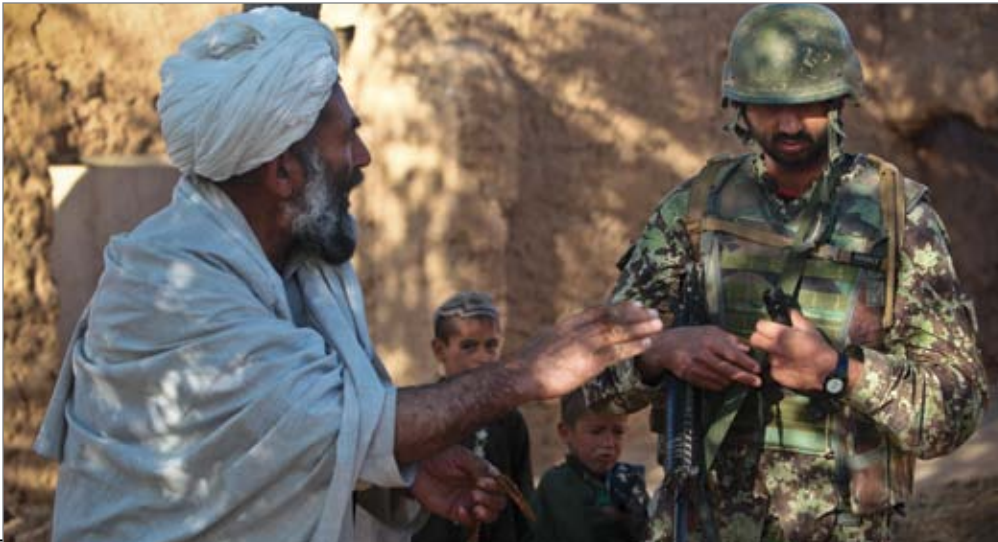
Afghan National Army soldier questioning villager.

$82 million Defense Afghan Defense University —Defense awarded a contract for about $82 million for the design and construction of Afghan Defense University, Afghanistan’s West Point. As the size of the ANSF tripled, the contract costs grew. 5 During an August 2010 Commission trip to Afghanistan, Defense officials said it would cost $40 million per year to operate and maintain—an amount possibly beyond the Afghan government’s ability to fund.