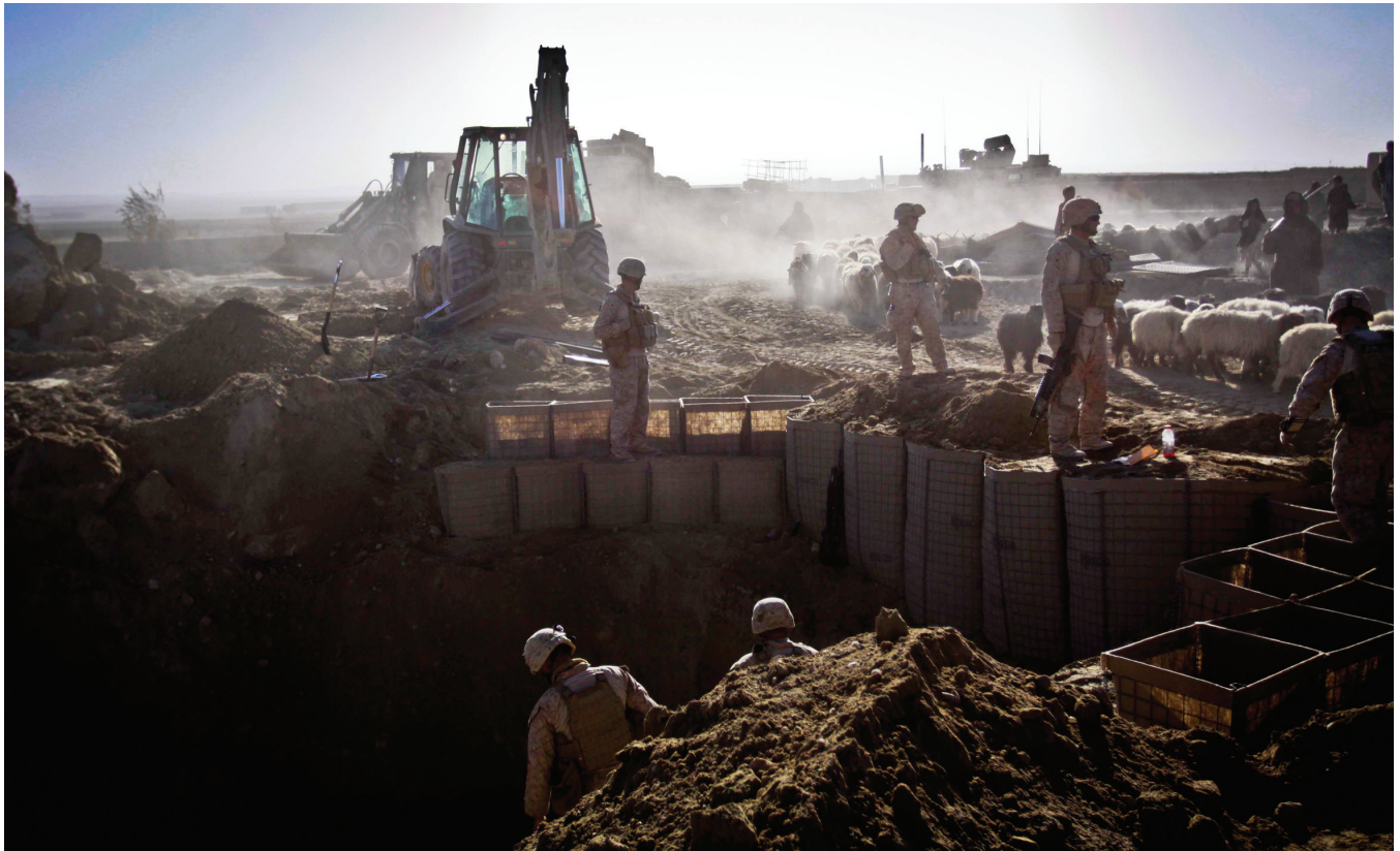
Marines building a bridge, Helmand province, Afghanistan.

There is no one senior official in the Executive Branch who can provide overall visibility, strategic direction, mission alignment, and resource allocation. Nor is there a single office specifically responsible for managing contingency-operations budgets.