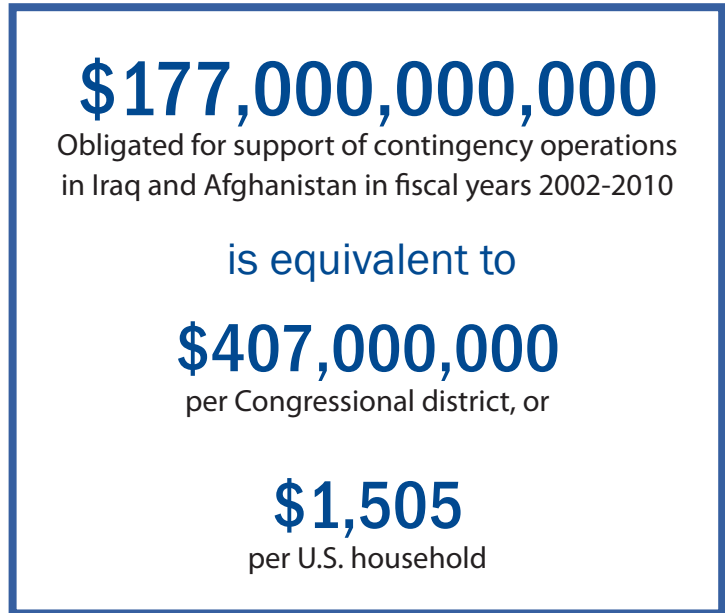
Figure 2: Contract and grant obligations

Each section contains specific, actionable recommendations that should be implemented in the near term to be most effective in countering the problems identified in the analysis of issues.