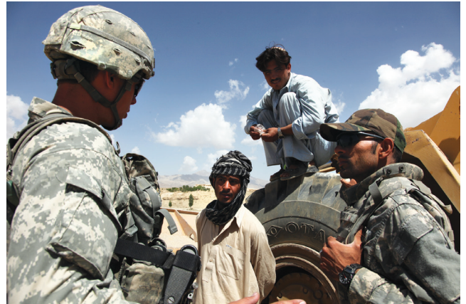
Army officer with Afghan contractors (U.S. Army photo, July 2010).