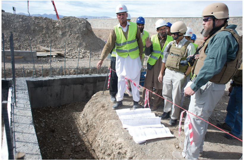
USAID representatives at hospital construction site, Afghanistan (U.S. Air Force photo, Nov. 2010).

agreements with the Department of Justice. As a part of these agreements, the contractors often concede to a statement of facts and admit to certain misconduct. However, these agreements often allow contractors to avoid prosecution, and contractors may make the admissions only with the caveat that they cannot be used in a future suspension or debarment proceeding. Such arrangements allow contractors with a history of misconduct to remain eligible for future government contracts.