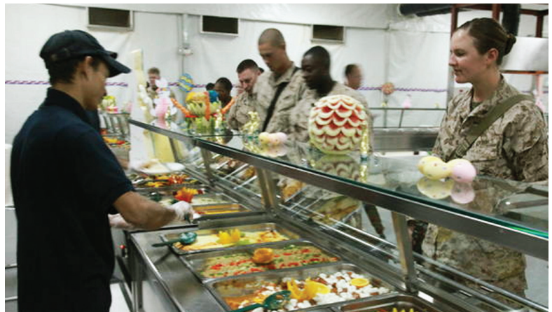
Contractor serving lunch at Camp Leatherneck, Afghanistan.

Real competition is an effective government tool to obtain the best value for taxpayers' money and to encourage contractor productivity and innovation.