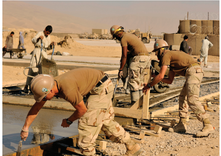
U.S. sailors and Afghan contractors building helicopter landing pads at base in Afghanistan.

part of the “total force” for contingency operations. But the declared total-force policy that includes contractors is at odds with agencies’ failure to plan for their reliance on contractors. During Commission discussions with the Defense Assistant Deputy Undersecretary (Program Support), he suggested the need for joint planners to include contractors in the military’s time-phased force-deployment requirements. DoD’s failure to meaningfully emphasize operational contract support in the 2010 Quadrennial Defense Review (QDR) was a lost opportunity to signal its importance for future strategic planning and execution.