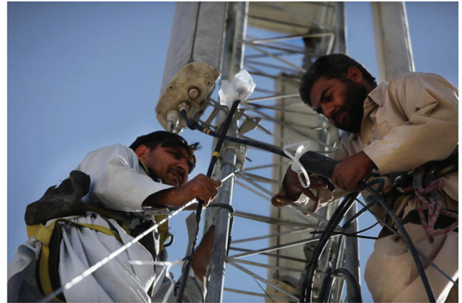
Afghan contractors working at new cellular telephone tower, Helmand province, Afghanistan.

Many contractors with business-system deficiencies are still insufficiently incentivized to correct deficiencies in a timely manner. Following a Commission hearing in 2009, DoD proposed a new rule to define system requirements and stimulate contractor compliance. In the National Defense Authorization Act of fiscal year 2011, Congress authorized DoD to withhold payment to contractors with inadequate business systems as a means of protecting U.S. government interests and compelling contractor compliance. The promise of these initiatives has not been fully realized, and the new authority cannot serve as a meaningful incentive unless payments are actually withheld.