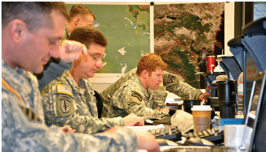
Training exercise at Army Command and General Staff College (Army photo, 2010).