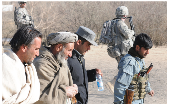
Afghan police officer and U.S. soldiers with village elders, Afghanistan.

Camp mayors often have limited experience in fulfilling their installation and contractor-management functions, yet an organization with the necessary expertise already exists. Despite having developed this expertise through years