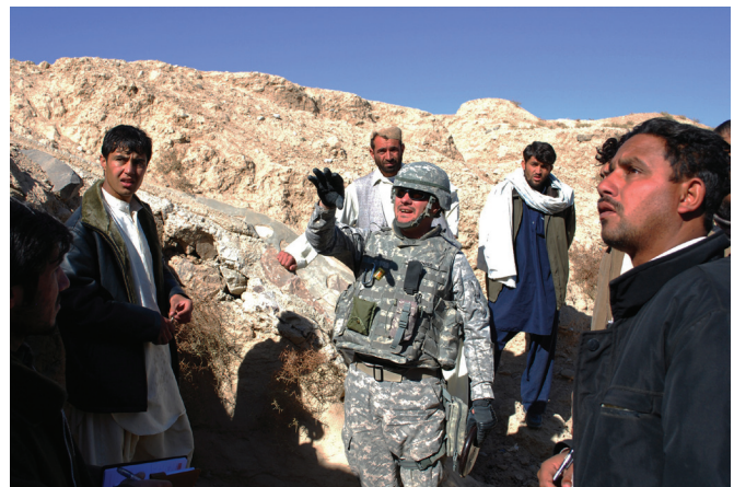
Provincial Reconstruction Team at erosion-control project near Qalat, Afghanistan (U.S. Air Force photo, Dec. 2010).

The contracting flexibilities allowed by law, including exemptions from most competition requirements, are useful at the onset of a contingency. However, as the contingency-contracting environment matures, agencies should introduce more competitive practices. Competitive approaches would include looking for opportunities to transition to fixed-price contract types that will broaden the pool of qualified contractors and ensure more equitably balanced risks.