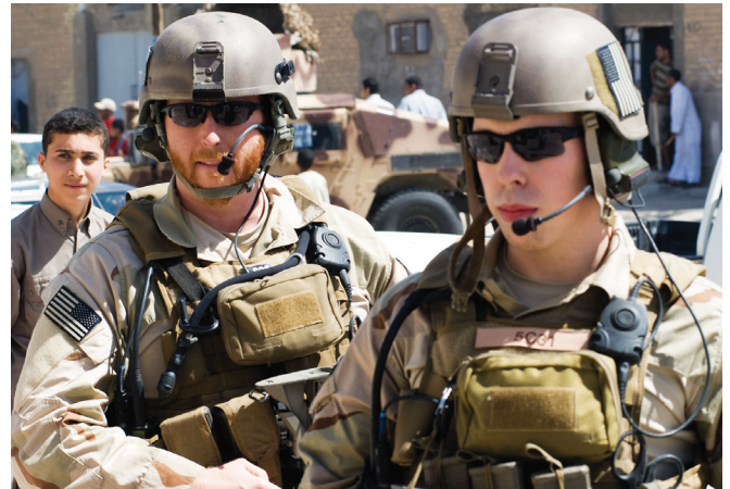
Civilian security contractors at hospital in Basra, Iraq (U.S. Navy photo, March 2009).

The trend toward contracting out security also reflects the government's human-resource constraints. With Congressionally mandated overall force-strength ceilings, and with limits on military force-strength "in theater," DoD has had to choose between using military personnel or security contractors for force protection. The State Department has limited numbers of diplomatic security agents in its Bureau of Diplomatic Security, while USAID has no organic security capability.