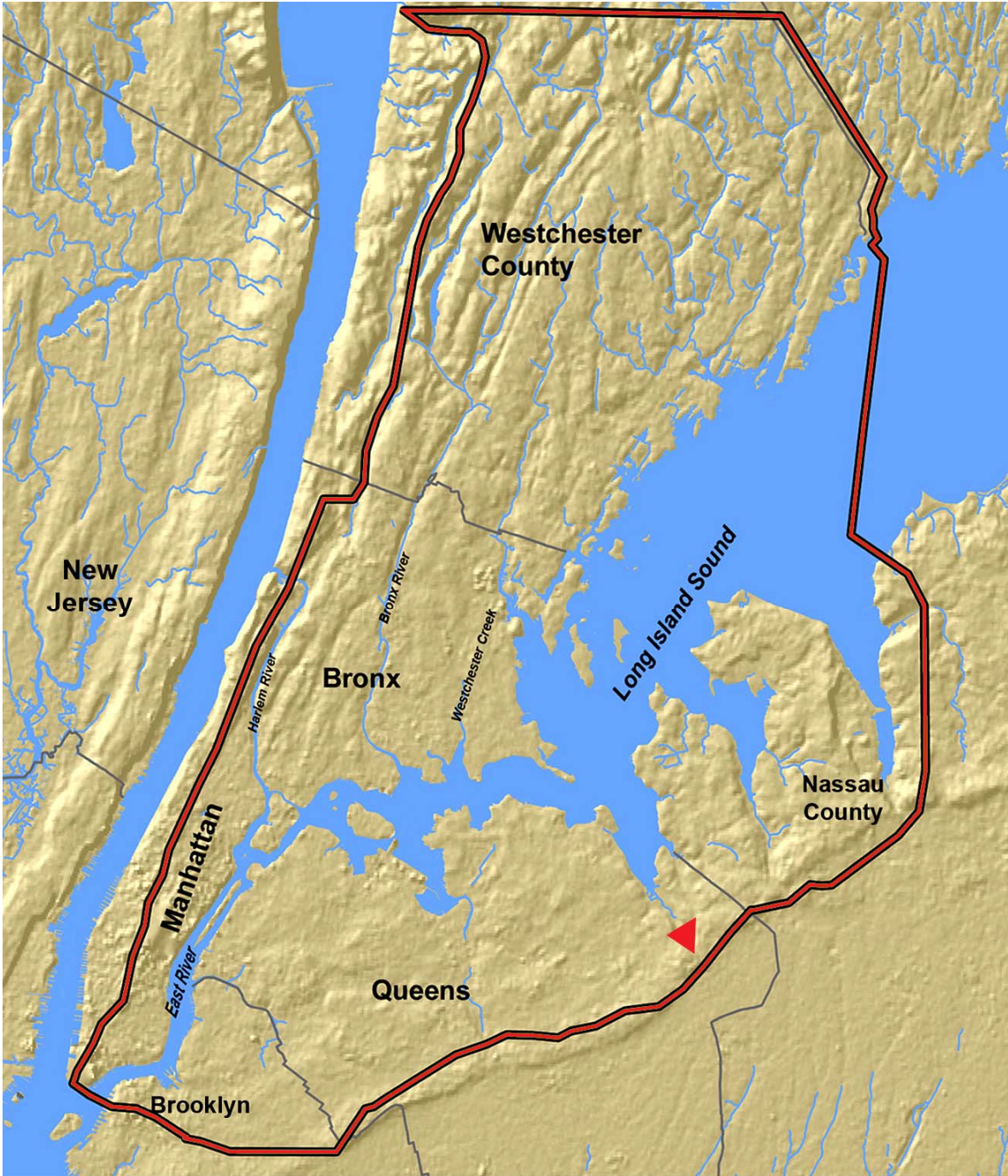
Planning Region -- Harlem River, East River, Western Long Island Sound