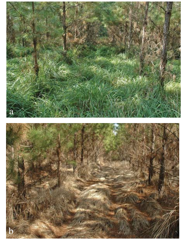
Figure 5 a) growing season b) dormant season

To increase application effectiveness, prescribe burn, if feasible, during winter before treatment to eliminate logging debris and cogongrass thatch at harvest. Chemically site prepare with Arsenal AC (2 pints per acre) or Chopper (4 pints per acre) plus glyphosate at 4 pounds active ingredient per acre in the fall prior to planting in late winter (at least 3 months after application). This combination may be applied by helicopter and should include a suitable surfactant not to exceed 0.5%.