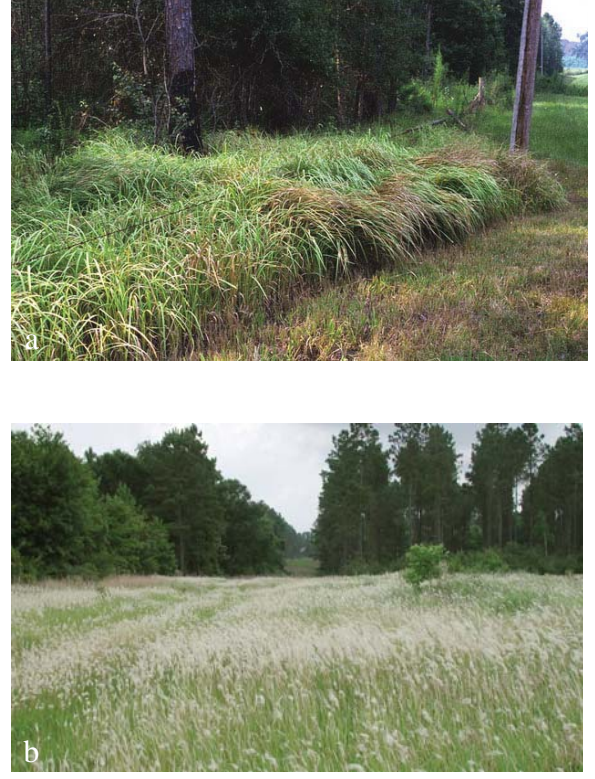
Figure 4 a) small infestation b) right-of-way infestation

rates and using tank-mix combinations, cogongrass often regenerates within a year following a single application of either product. A minimum of two applications per year is needed, realizing that older infestations may require 2 to 3 years of treatment to eliminate rhizomes. Glyphosate has no soil residual activity. Imazapyr has both soil and foliar activity and can severely injure susceptible plant species that are planted too soon after the last treatment. Most vegetables, row crops, and ornamentals will be injured if planted with 24 months following an imazapyr application. As with all pesticides, proper handling and usage is of utmost importance and always read and follow label directions .