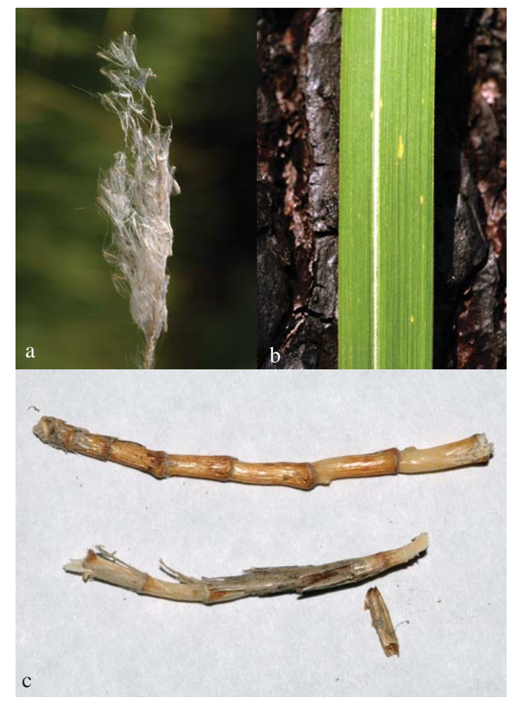
Figure 3 a) seedhead b) off-center midrib (vein) c) segmented rhizomes with paperlike sheaths, removed (top) and intact (bottom).

Tillage may not be an option on many sites such as steep slopes, established tree plantings, or around dwellings. Out of dozens of herbicides tested for significant activity on cogongrass only two, the active ingredients glyphosate (Roundup<sup>a</sup>, Glypro, Accord<sup>b</sup>, etc...) and imazapyr (Arsenal, Arsenal AC, and Chopper<sup>c</sup>), have much effect on this grass (6). Even at high