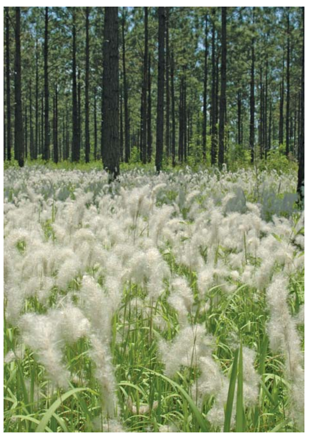
Figure 1. Forest infestation in Seminole County, Georgia

Cogongrass has some distinctive vegetative features that aid identification. Cogongrass rarely is found as a single plant as it quickly forms patches or infestations, often circular in outline. Plants vary in height, even in the same patch, from 1 to 5 ft. tall (1,5). Taller leaves will lean over in late summer. Leaves measure ½ to 1 inch in width and are commonly 12 to 30 inches long. They rarely have a lush green color; instead, they often appear mostly