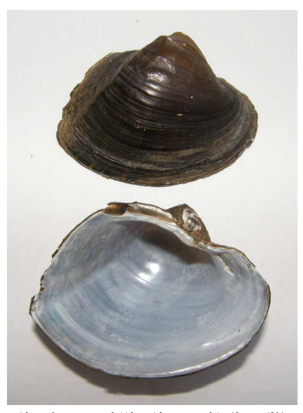
Altamaha arcmussel ( Alasmidonta arcula) 60 mm (2<sup>1</sup>/<sub>3</sub> inches). Altamaha River, Wayne Co., Georgia.