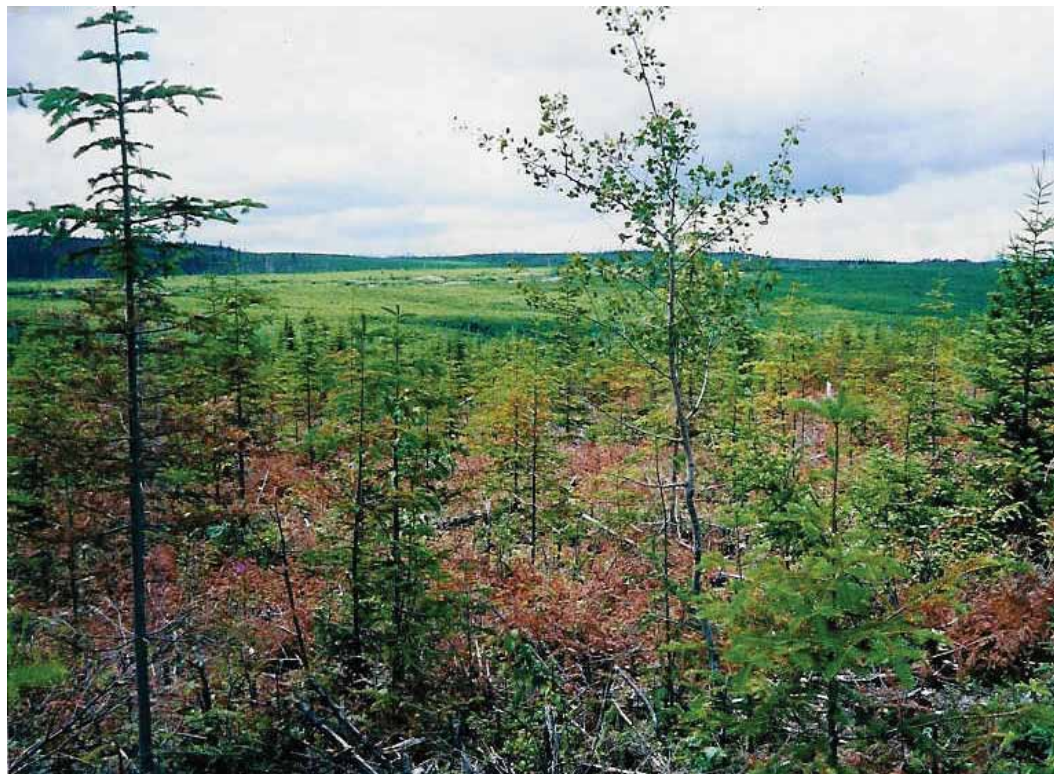
Recently-thinned industrial forest in New Brunswick.

Clear-cutting in industrial highlands may affect Bicknell's