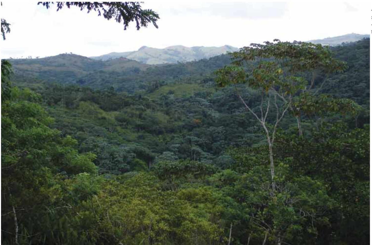
Mid-elevation wet broadleaf forest in Cordillera Septentrional, Dominican Republic