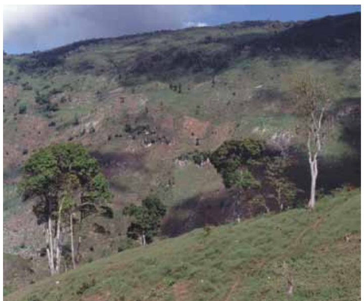
Severe deforestation along the Dominican-Haitian border

Habitat loss and degradation are widely recognized as a major cause of population declines in birds worldwide. In the Caribbean, forests have been extensively cleared for agriculture and subsistence living. Almost all natural forest in Haiti has been cleared with < 2% of original forest remaining (Paryski et al. 1989, Sergile 2008). While forested habitat covers 27.5% of the Dominican Republic's land base (Tolentino and Pena 1998), 21% in Cuba (Mugica 2008), and 25% in Jamaica (Stattersfield et al. 1998), much of the