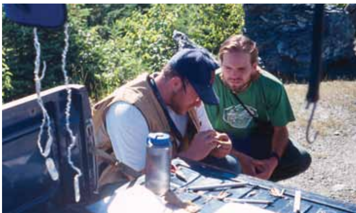
Banding studies yield important data on Bicknell's Thrush population biology and ecology.