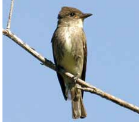
The Olive-sided Flycatcher will benefit from actions aimed at Bicknell's Thrush.

Conservation actions aimed at Bicknell's Thrush are likely to benefit co-occurring species, some of which are also conservation priorities. Tables 1 and 2 list at-risk or endemic species that occupy the same habitats as Bicknell's Thrush and would likely benefit from conservation efforts on the species' breeding and/or wintering grounds. Some species may co-occur with Bicknell's Thrush only in parts of their range, and thus be of regional conservation interest, while others have broad range overlap.