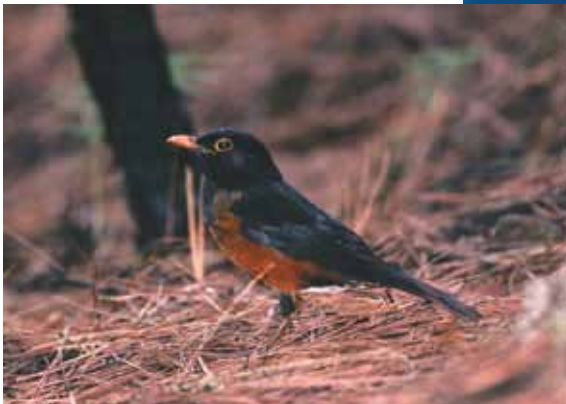
Endangered Hispaniolan endemics such as La Sella Thrush (left) and Black-capped Petrel (right) stand to benefit from conservation actions targeted at Bicknell's Thrush.