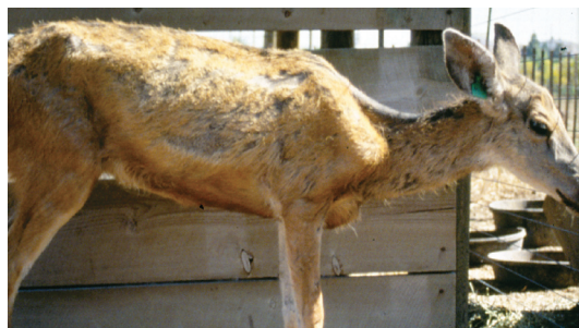
Infected mule deer with CWD

mule deer in a limited number of areas in North America. It belongs to a group of diseases known as transmissible spongiform encephalopathies (TSEs) that result in distinctive brain lesions believed to be caused by a modified protein (prion). TSEs include diseases such as scrapie in sheep, mad cow disease in cattle, and Creutzfeldt-Jakob disease in humans. Due to the potential health and economic impacts, diligent surveillance and accurate information are critical to managing CWD effectively. The national CWDDC is designed to address this need, allowing easy access to CWD surveillance, research, and testing data.