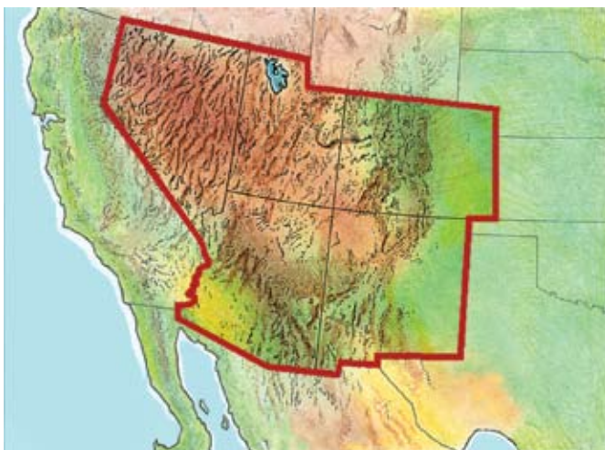
Geographic coverage of the NBII Southwest Information Node

The National Biological Information Infrastructure (NBII) < www.nbii.gov > is an electronic information network that provides access to biological data and information on our nation's plants, animals, and ecosystems. Data and information maintained by federal, state, and local government agencies; non-government organizations; and private-sector organizations are linked through the NBII gateway and made accessible to a variety of audiences including researchers, natural resource managers, decision-makers, educators, students, and other private citizens.