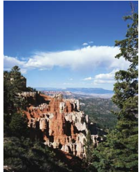
Agua Canyon, Utah

As a Web-accessible gateway to biological