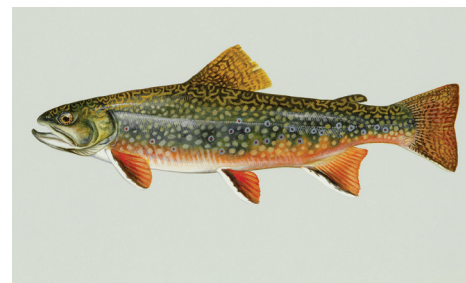
Sturgeon (left) and brook trout (right). FAR is currently creating information systems for both species. Images from the U.S. Fish and Wildlife Service National Image Library.