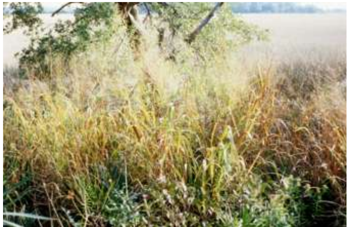
Switch grass ( Panicum virgatum )