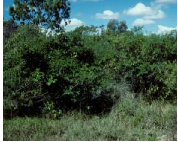
Chinee apple thicket near Charters Towers