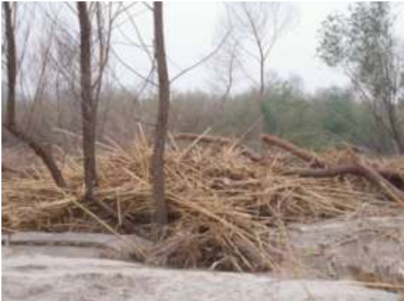
Giant reed flood debris in California