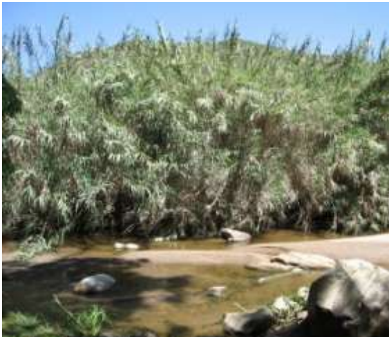
Giant reed in its preferred habitat