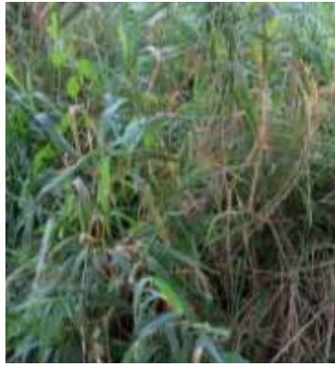
Reed canary grass ( Phalaris arundinacea )