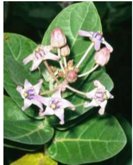
Giant milkweed ( Calotropis gigantea )