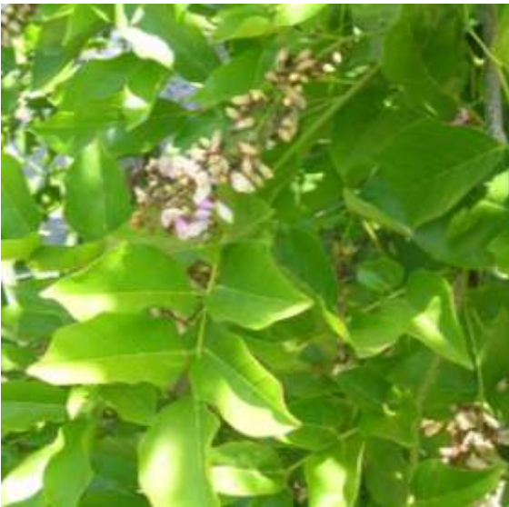
Pongamia ( Milletia pinnata )