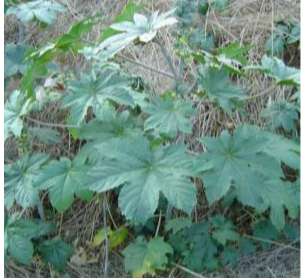
Castor oil plant ( Ricinis communis )