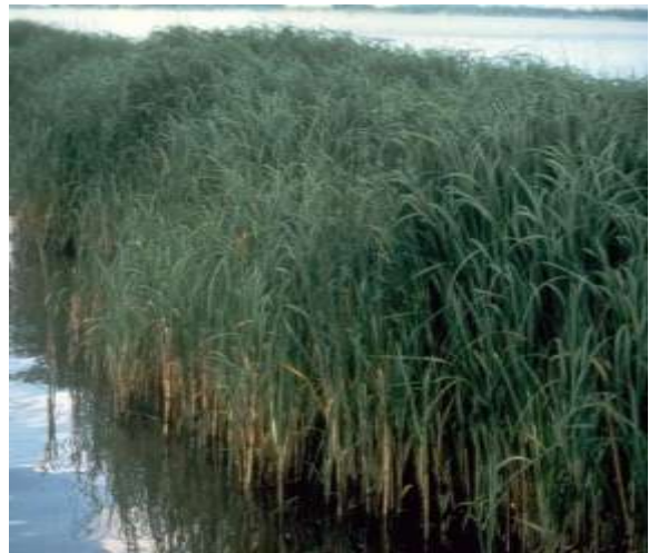
Spartina ( Spartina alterniflora )