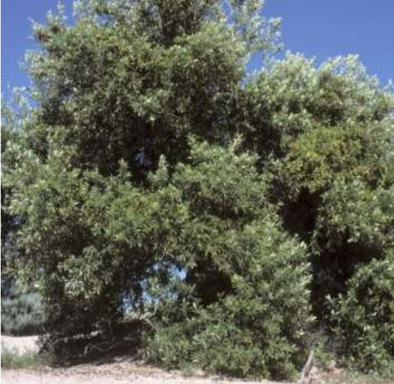
Olive ( Olea europaea ) near Adelaide