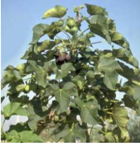
Jatropha ( Jatropha curcas )