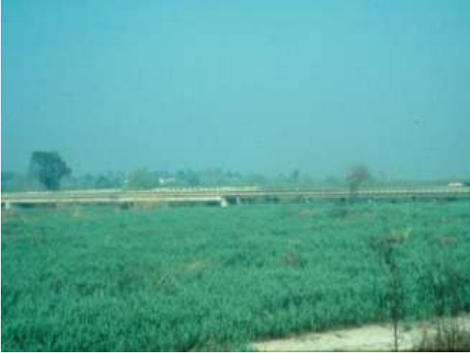
Giant reed ( Arundo donax ) invasion in California