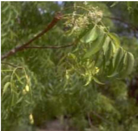
Neem tree ( Azadirachta indica )