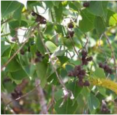
Chinese tallow ( Triadica sebifera )