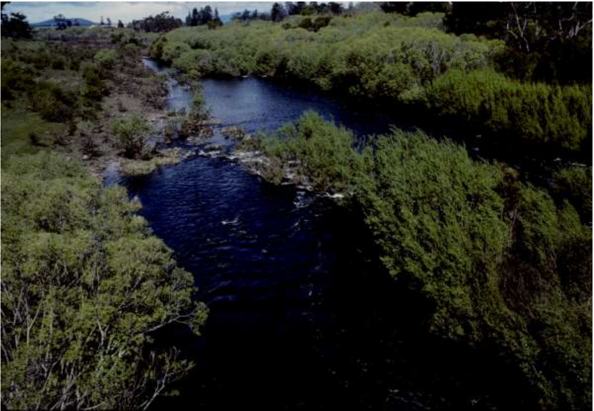
Willows ( Salix ) near Perth, Tasmania, completely dominating the river environment