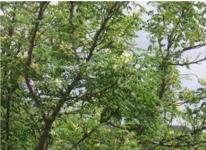
Moringa ( Moringa pterygosperma )