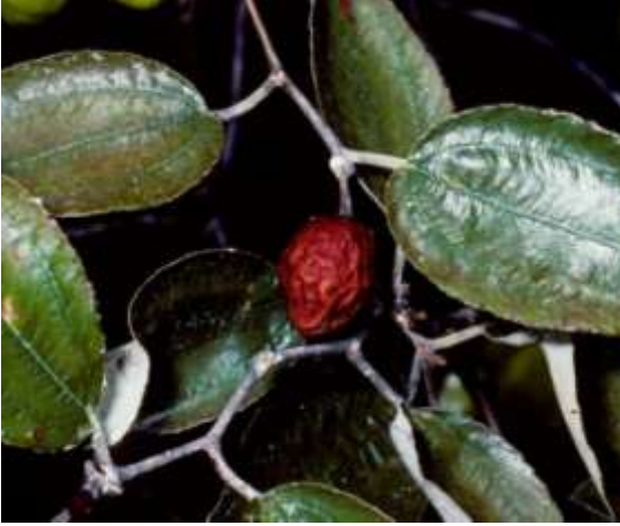
Chinee apple ( Zizyphus mauritiana )