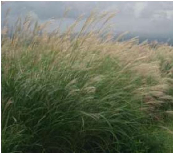
Miscanthus ( Miscanthus sinensis )