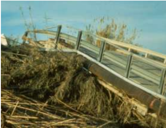
Californian bridge damaged by reed debris