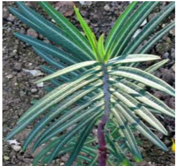
Caper spurge ( Euphorbia lathyris )