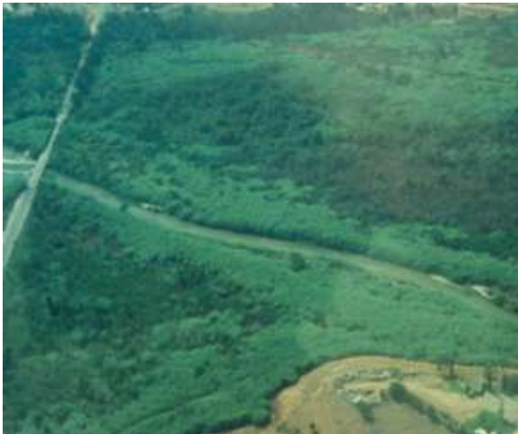
Aerial view of giant reed invasion in California