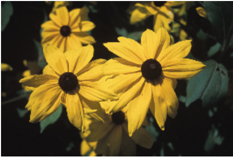
Black-eyed Susan (Rudbeckia hirta)

Other projects in the Mid-Atlantic Region include: