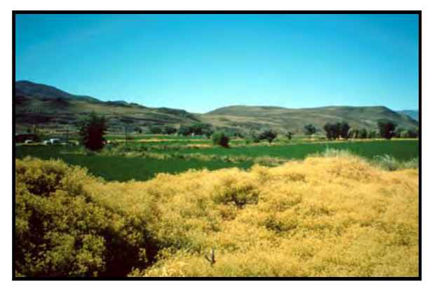
Do not delay beginning treatment of tall whitetop. Every year you wait adds to the expense of managing this invasive weed.

It is important to bear in mind that our assessment only examines, and very conservatively at that, the impacts on out-ofpocket costs in the first year of the tall whitetop Project. Of course, postponing con-