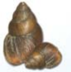
Chinese Mystery Snail