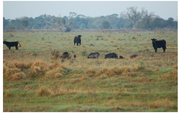
Figure 16. Wild hogs may be a reservoir for diseases and parasites that can affect people, livestock, and wildlife.

and people. Hogs have been known to carry dozens of such pathogens, including cholera, pseudorabies, brucellosis, tuberculosis, salmonellosis, anthrax, ticks, fleas, lice, and various flukes and worms. Although these pathogens and parasites typically do not present a serious threat to people, they do threaten livestock. Millions of dollars are spent each year to keep livestock safe from diseases and parasites spread by wild hogs (Figure 16). Finally, hogs can be dangerous. Although wild hogs usually prefer to run and escape danger, if they are injured, cornered, or with young, they can become aggressive, move with great speed, and cause serious injury (mainly with their hooves and tusks; Figure 17).