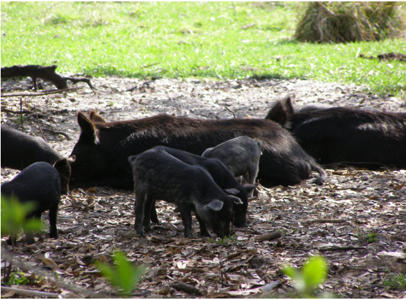
Figure 11. Feral hogs typically breed at one year of age. Piglets stay in the nest for a few weeks, and then begin moving with the sow. When conditions are good, hog production often exceeds mortality leading to overabundant populations.

mammals (including deer fawns). Wild hogs have also been known to consume young domestic livestock including poultry, lambs, and goats.