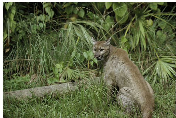
Figure 10. Humans are the primary predator of adult wild hogs. However, the Florida panther and other predators can easily prey upon younger animals.

cover during the day, and feed and be most active at night. Seasonal changes in activity are also related to breeding, with sows being less active and traveling over significantly smaller areas when piglets are in the nest, and males traveling over considerably larger areas in search of mates.