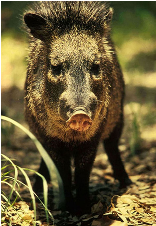
Figure 2. Although they look similar to wild hogs, peccaries are not true pigs. Not found in Florida, they are the only native, pig-like animal in North America.

and those escaping from captivity established feral populations throughout Florida. These feral populations have been further supplemented through deliberate releases of hogs in many areas by private individuals and the Florida Game and Freshwater Fish Commission to improve hunting opportunities (although the state no longer does this).