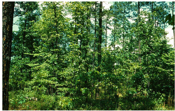
Figure 6. Wild hogs prefer to live in large tracts of forest with abundant food, dense understories, access to water, and little human disturbance.

of animals including worms, insects, crustaceans, mollusks, fish, small birds, mammals, reptiles, and amphibians. They may occasionally consume carrion (dead animals). Wild hogs consume far more plant than animal material, and their opportunistic tendencies often lead them to forage in agricultural lands and forest plantations where they can cause significant losses of crops, including corn, rice, sorghum, melons, peanuts, forage grasses, grains, various vegetables, and tree seedlings. Wild hogs will