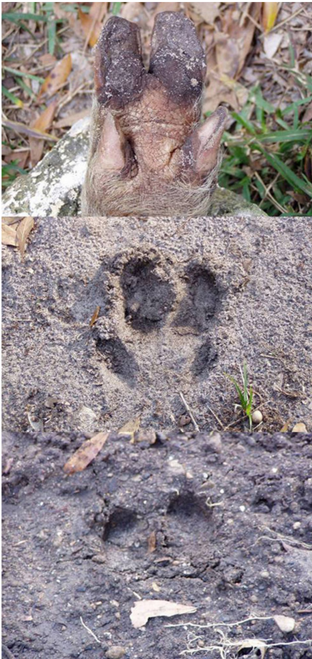
Figure 5. Wild hog feet and tracks are similar to those of domesticated pigs. Typically, the rear toes make little or no mark on the ground.

of animals including worms, insects, crustaceans, mollusks, fish, small birds, mammals, reptiles, and amphibians. They may occasionally consume carrion (dead animals). Wild hogs consume far more plant than animal material, and their opportunistic tendencies often lead them to forage in agricultural lands and forest plantations where they can cause significant losses of crops, including corn, rice, sorghum, melons, peanuts, forage grasses, grains, various vegetables, and tree seedlings. Wild hogs will