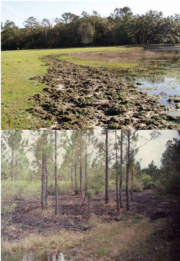
Figure 15. Rooting by wild hogs can lead to erosion and water quality problems, and the destruction of native vegetation around ponds and in the forest.

and people. Hogs have been known to carry dozens of such pathogens, including cholera, pseudorabies, brucellosis, tuberculosis, salmonellosis, anthrax, ticks, fleas, lice, and various flukes and worms. Although these pathogens and parasites typically do not present a serious threat to people, they do threaten livestock. Millions of dollars are spent each year to keep livestock safe from diseases and parasites spread by wild hogs (Figure 16). Finally, hogs can be dangerous. Although wild hogs usually prefer to run and escape danger, if they are injured, cornered, or with young, they can become aggressive, move with great speed, and cause serious injury (mainly with their hooves and tusks; Figure 17).