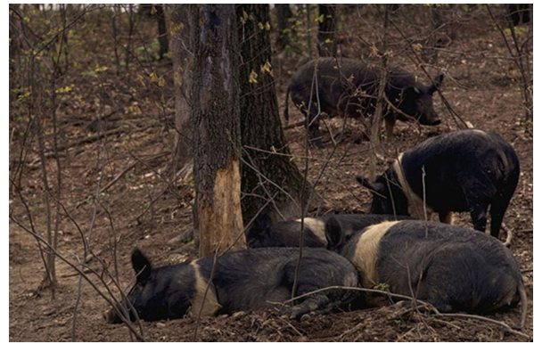
Figure 4. Wild hogs rub objects, often trees, for body scratching, and boars may "tusk" small trees as part of a dominance display.