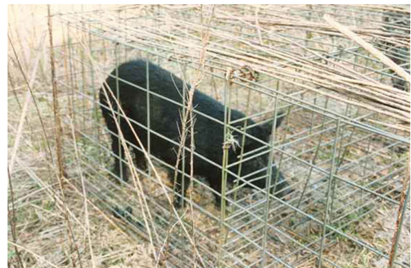
Figure 20. Small, portable traps can be effective by allowing you to change trapping locations. However, they are limited in the number of animals that can be caught on one occasion.

welded 12 gauge (or heavier) wire fencing works well. Larger traps (often as large as ten feet square) will allow more hogs to be captured at once. Doorframes can be made of wood or steel, with doors made of plywood (more than 3/4-inch), steel, or wire mesh. Doors should be at least two feet by two feet. They should only open inward or upward (for sliding doors), and they should close with the use of heavy springs. Swinging doors are better than sliding doors because once an animal is caught, other animals can enter by pushing through the door, and hogs often learn to pry open sliding doors with their snouts. Doors should close down on a bar or cross member to prevent hogs from lifting them open. A trip wire placed in the rear of the trap is often used to trigger the door. Bait should be placed at the rear of the trap, with the trip wire between it and the door. Wire fence, attached to the walls, should be put on top (particularly if the trap has short walls) to prevent hogs from going over the top. Smaller, portable traps have also been used successfully (Figure 20). However, their size typically limits the number of captures on a single occasion to one or a very few animals. Trap construction plans can be found at sites listed in the Additional Information section at the end of this document.