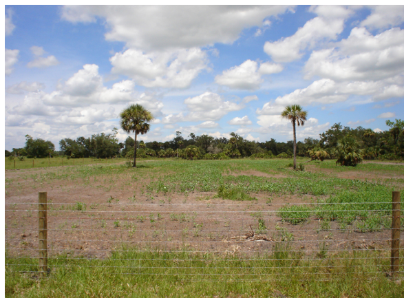
Figure 22. Fencing can be an effective method of protecting small areas from wild hog damage.

Excluding hogs using fencing can be an effective but expensive control option for relatively small areas such as a garden (Figure 22). However, hogs are intelligent and resourceful animals and often find ways through many types of fence. Chain link fences or heavy-gauge hog wire buried at least 12 inches under the ground with heavy supports and posts, and various types of mesh or multi-stranded electric fence provide the best results.