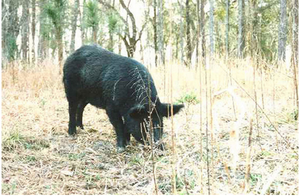
Figure 1. A wild hog foraging in a field. These animals are true pigs and not native to Florida or North America.

It is believed that hogs were first brought to Florida, and possibly the United States, in 1539, when Hernando de Soto brought swine to provision a settlement he established at Charlotte Harbor in Lee