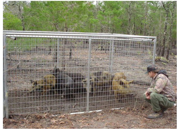
Figure 18. Trapping of wild hogs has been used to reduce populations and associated damage in some areas and supplement hog populations for harvest in others.

of methods on a sustained basis. Wild hog control methods include hunting, various trapping methods, shooting, and exclusion. Toxicants and repellents have been suggested as viable means of controlling or deterring hog populations. However, none are registered for use in the United States. Before undertaking any hog control measure, review local laws. The Florida Fish and Wildlife Conservation Commission ( http://myfwc.com/ ) and USDA-APHIS