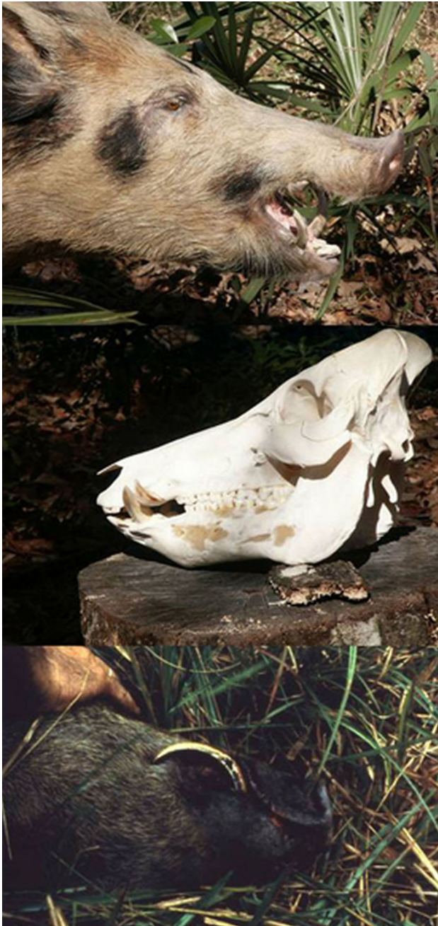
Figure 17. Wild hogs can be aggressive, and long, sharp tusks make them dangerous.

of methods on a sustained basis. Wild hog control methods include hunting, various trapping methods, shooting, and exclusion. Toxicants and repellents have been suggested as viable means of controlling or deterring hog populations. However, none are registered for use in the United States. Before undertaking any hog control measure, review local laws. The Florida Fish and Wildlife Conservation Commission ( http://myfwc.com/ ) and USDA-APHIS