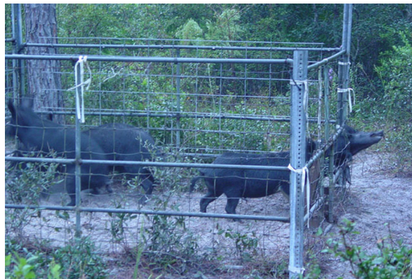
Figure 21. Traps should be checked from a distance to avoid alarming the animals, which can cause injury to the hogs and damage traps.

and trapping is ineffective or incomplete. Spotlights with red filters and night vision optics are valuable aids when using this method. Before using such methods, individuals should check with the Florida Fish and Wildlife Conservation Commission for applicable regulations and permits.