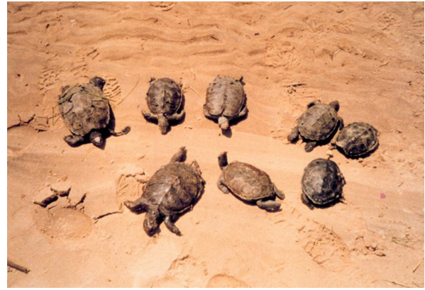
Figure 13. Hogs often prey upon the nests of ground nesting wildlife, including turtles, leading to significant nest losses.

Hogs rub objects, often trees, to scratch themselves. In addition, males will often "tusk" small trees, scraping off the bark with their tusks, in what is thought to be some type of dominance display. Such