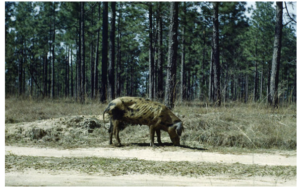
Figure 9. A female wild hog in poor condition forages along a road. Poor nutrition will lead to lower reproductive success.

Wild hogs typically range over 450–750 acres, but may range wider in search of food. During the cooler months of the year, hogs may be active and feed during both day and night. However, if hunting pressure or temperatures are high, they will seek