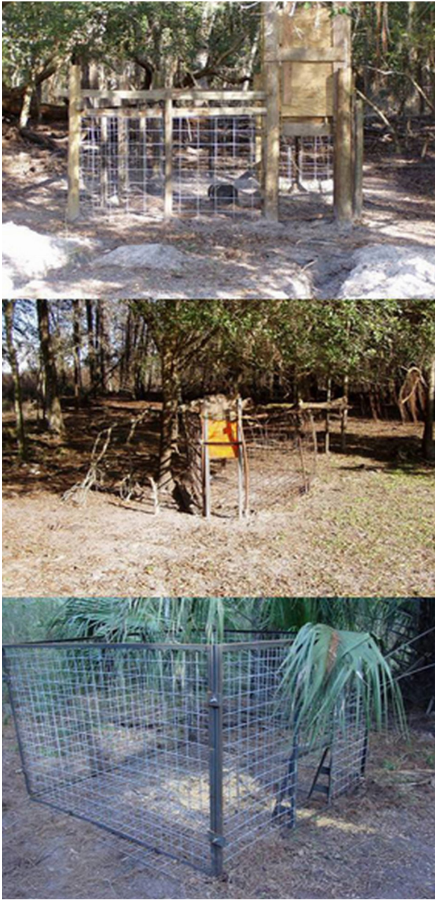
Figure 19. Baited hog traps can be an effective control method and come in various shapes and sizes. They should be sturdy enough to contain large hogs and have tall walls or a wire roof to prevent hogs from climbing or jumping out.

Cage- or corral-style live traps are the most commonly used types (Figure 19). Such traps should be located in shaded areas with large, active hog populations. This type of trap includes single- and multi-capture designs with various door/gate styles, including swinging or sliding doors and lift gates. These traps can be made from a variety of materials, however, steel fence posts with 4-inch by 4-inch,