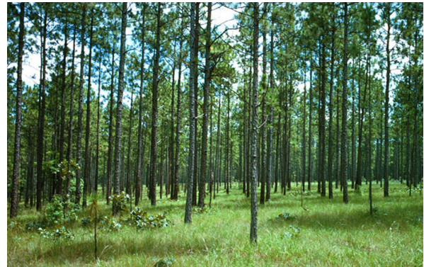
Figure 14. By eating seeds and seedlings, wild hogs can inhibit forest regeneration.

actions can seriously damage the rubbed objects (Figure 4).