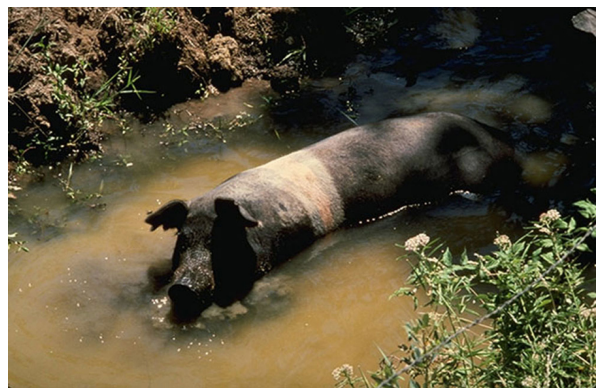
Figure 7. Wild hogs wallow to stay cool and reduce parasite infestation.