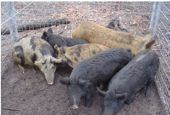
Figure 3. Wild hogs occur in a variety of colors.