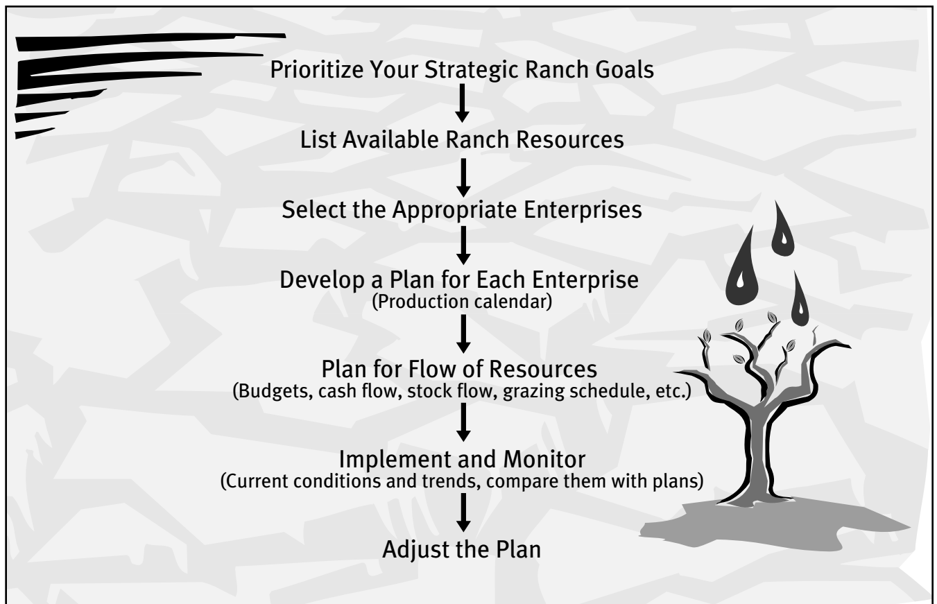
Figure 1. Process for deciding what to do when a drought occurs.