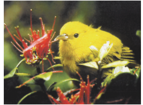
Hawaiian Anianiau Honeycreeper