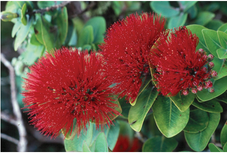
Ohia Lehua Tree