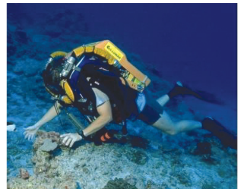
Hawaiian Coral Reef

PBIN will help integrate the vast amounts of data by addressing two basic questions of science. What is it? And where is it? The answers to these two questions form the foundation for scientific advancement and decision-making and are also