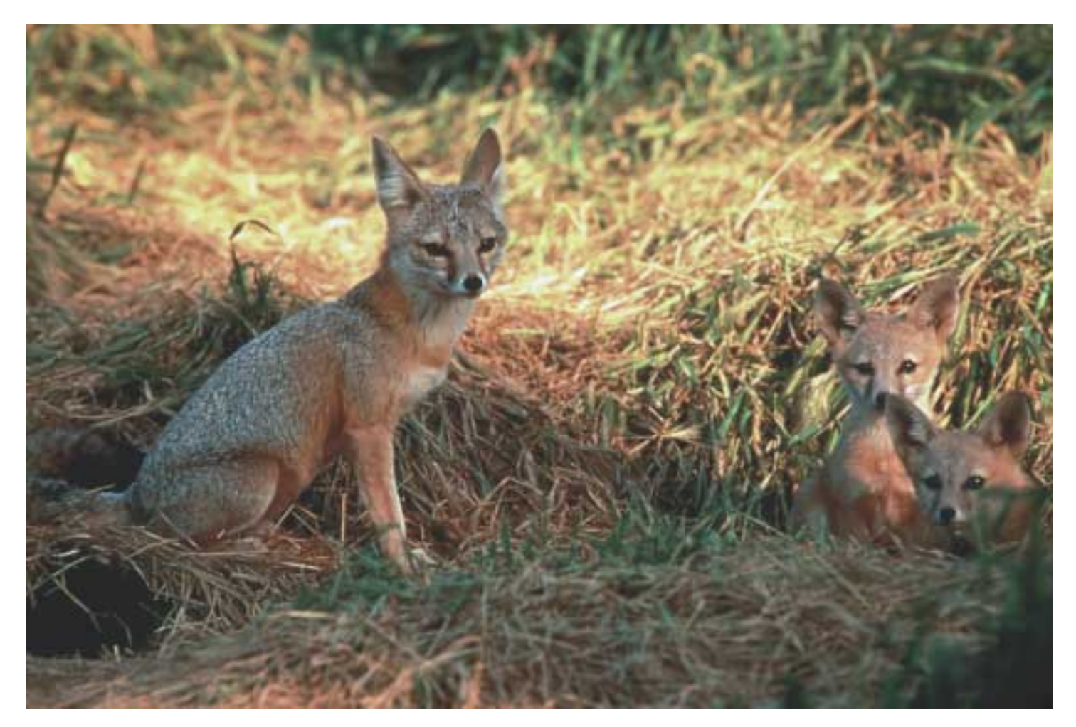
San Joaquin kit foxes (Vulpes macrotis mutica)