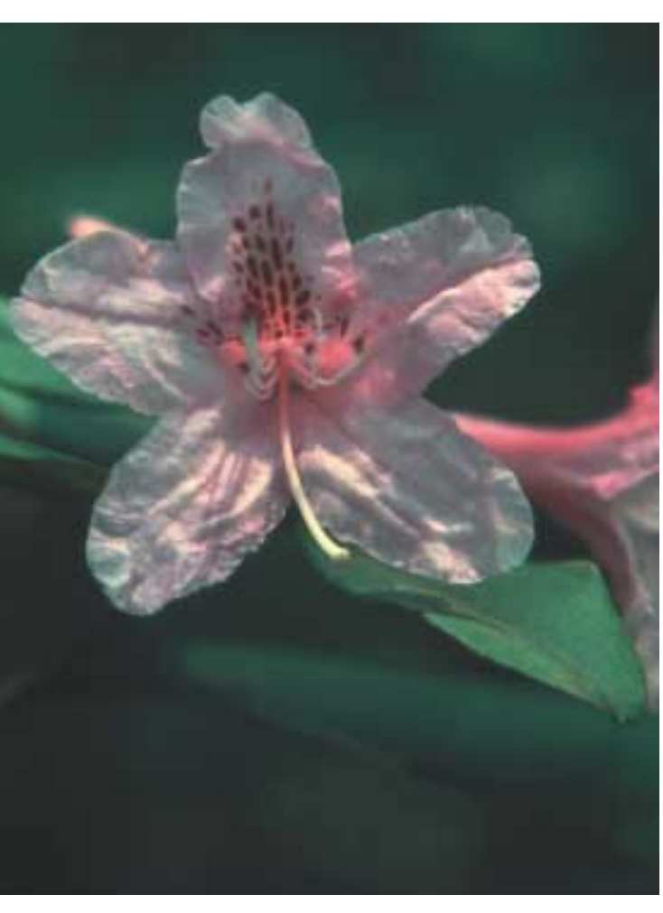
Chapman rhododendron (Rhododendron chapmanii), an endangered plant from Florida