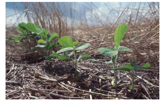
FIGURE 3. Soybeans growing in wheat stubble.

1. Leaving crop residue will protect the soil, and the grains can be used by wildlife as a food source.