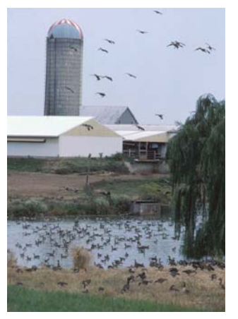
FIGURE 6. Geese are attracted to water and open areas.

1. Set clear goals and objectives. Determine what you would like to accomplish and why.