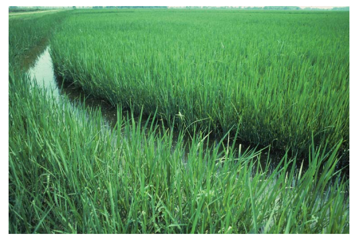
FIGURE 5. Irrigation ditches provide habitat for waterbirds.