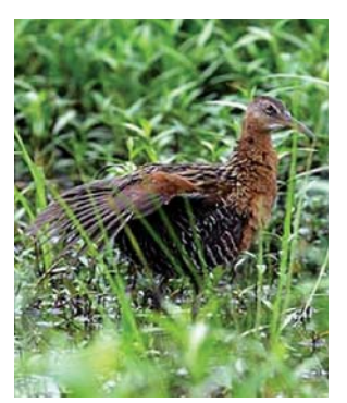
FIGURE 2. The secretive King Rail is a type of waterbird found in Arkansas which nests in weedy rice fields and adjacent ditches.

Many thrive on seeds or invertebrates attracted to decaying plant material. Some, like the American White Pelican and Double-Crested Cormorant, eat fish and can come into conflict with aquaculture production. However, most are beneficial to agriculture in reducing weed seeds and insect pests or