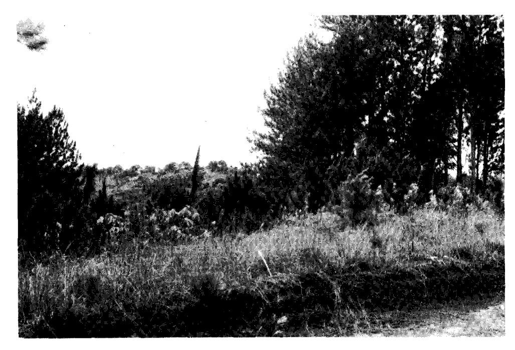
Figure 3.— Seedlings of Pinus caribaea invading an abandoned field next to a plantation in western Puerto Rico.