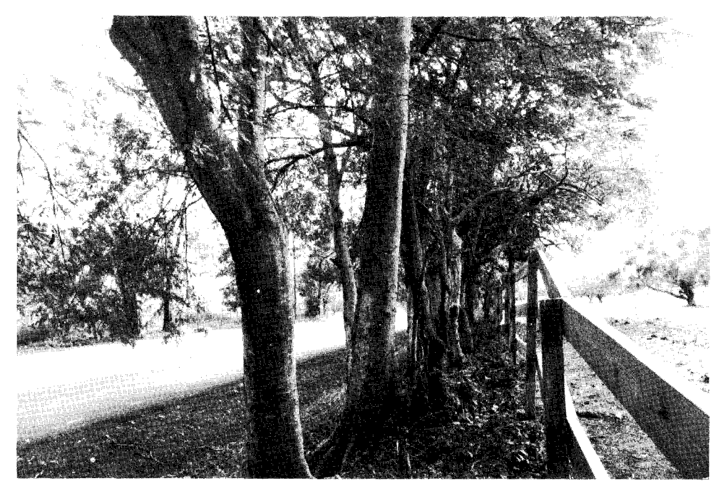
Figure 'L.-Naturalized Senna Siamea and Melicoccus bijugatus with native Ficus citrifolia on roadside near Coamo, Puerto Rico.