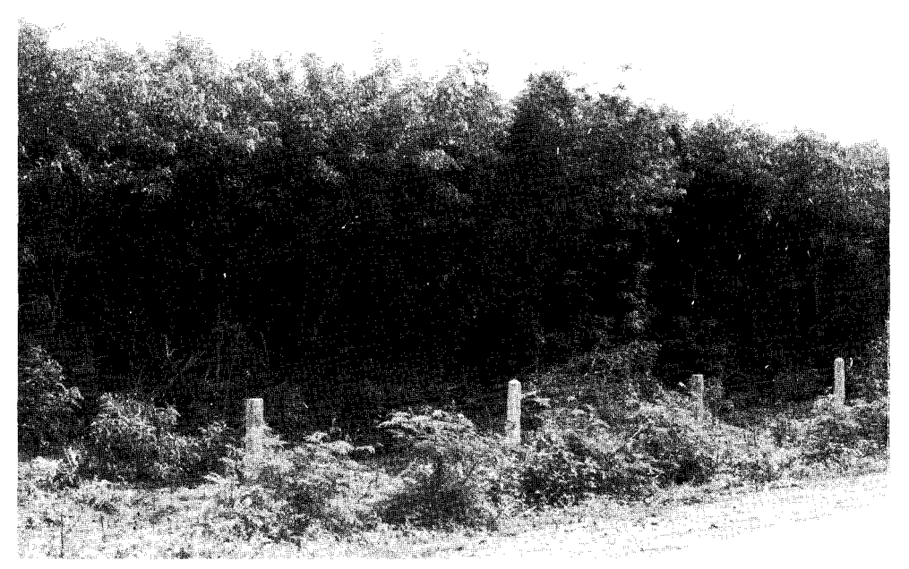
Figure 1.— Solid stand of Senna spectabilis that has invaded a former dry pasture near Penuela's, Puerto Rico.

could be the result of the invasion of a tree species under certain circumstances. As yet, neither has been documented in Puerto Rico. Each new addition to the plant community increases the local biological diversity. Tree species that remain noncompetitive or rare are of little concern, while those that become abundant and spread widely are more likely to have a significant impact. Species that have already become widespread and common or abundant are listed in table 2; those that are likely to do so within the next century are listed in table 3.