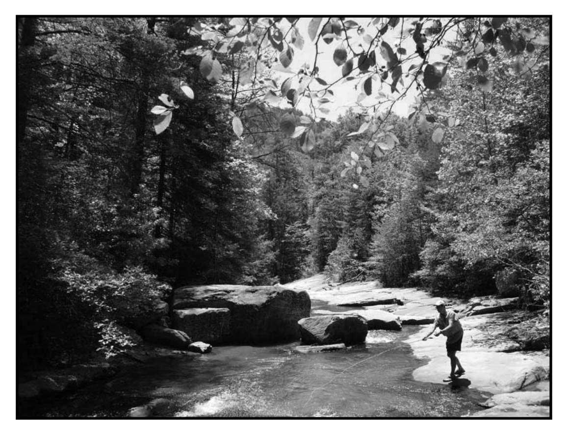
Fishing is one of the most popular activities in Jocassee Gorges, according to a research project conducted by Clemson University