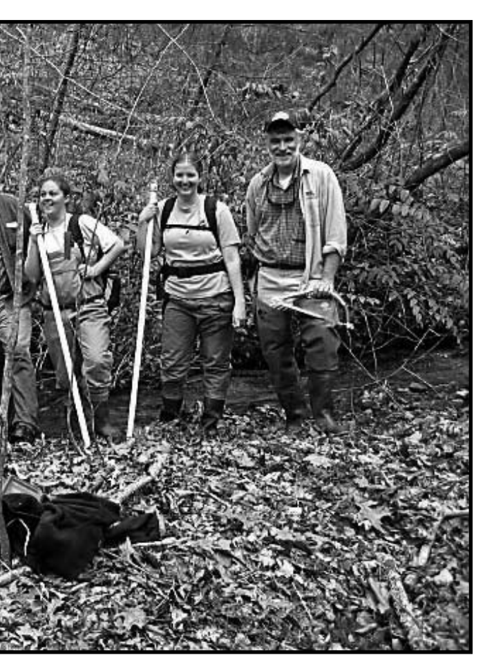
ation program included electroshockers from Jnlimited, and the S.C. Wildlife Federation.

ago. Removal of forest cover caused water temperatures to rise beyond the brook trout's tolerance and intense wildfires in the logging debris caused erosion and heavy sedimentation. Railroads and roads followed the stream bottoms into the mountains in those days and, in many cases, especially in steep "hollers," the stream channel itself was used as the road bed. Aquatic ecosystems were severely damaged by this type of exploitive logging and brook trout populations declined dramatically.