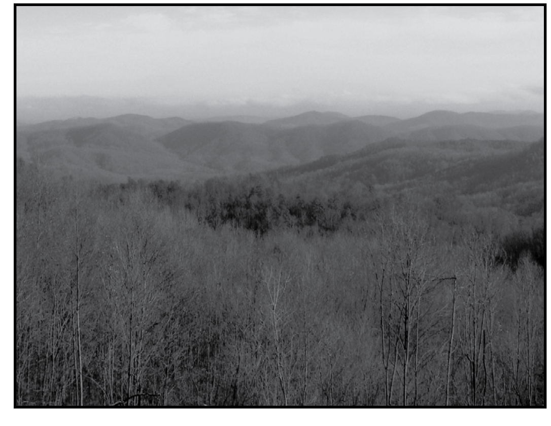
New vistas on Horsepasture Road provide some stunning views of South Carolina and North Carolina mountains.

are certain to quickly become favorite stopping points along the Jocassee Gorge's primary artery that runs the main ridges between US Highway 178 and Bootleg Mountain. The new sites will allow visitors to see spectacular views without having to travel the entire onehour-plus ride to Jumping Off Rock. The Jocassee Forest Management Plan, approved in 2004, called for additional vistas.