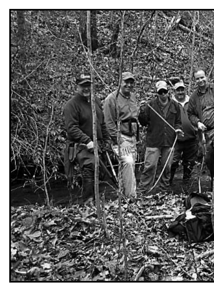
Partners for the South Carolina brook trout restor South Carolina DNR, U.S. Forest Service, Trout U

A Southern Appalachian brook trout is the object of desire of a coalition of agencies and organizations seeking to restore the fish to its traditional range in the South Carolina mountains.