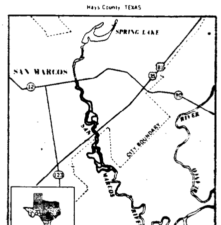
SAN MARCOS GAMBUSIA

San Marcos Gambusia (Gambusia georgei) Texas, Hays County; San Marcos River from Highway 12 bridge downstream to approximately 0.5 miles below Interstate Highway 35 bridge.