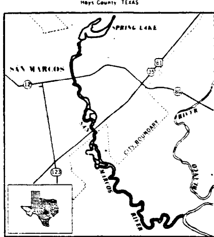
TEXAS WILD RICE

Family Poaceae: Texas Wild-Rice (Zizania texana) Texas, Hays County; Spring Lake and its outflow, the San Marcos River, downstream to its confluence with the Blanco River.