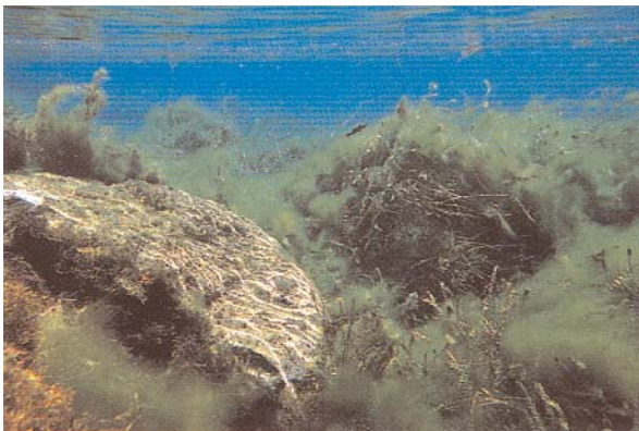
San Marcos River

adult. All life stages, except eggs, of Comal Springs riffle beetle are present throughout the year. Several larval instars have been observed in collections taken throughout the year indicating that the Comal Springs riffle beetle has overlapping, asynchronous generations.