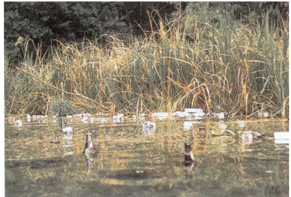
River pollution