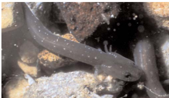
San Marcos Salamander

Federal Status: Endangered except for the San Marcos Salamander, which is listed as Threatened • State Status: Endangered except for the San Marcos Salamander, which is listed as Threatened