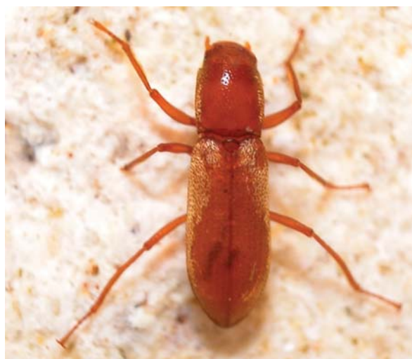
Comal Springs Dryopid Beetle

additional collections of this species have not been made at this location. Comal Springs riffle beetle is highly dependent on the constant and narrow range of habitat conditions associated with the springs-flows issuing from the Edwards Aquifer. Larval and adult riffle beetles both feed on microorganisms and debris scraped from the substrate. However, the specific feeding habits of this riffle beetle are unknown. All beetles (Coleoptera) are holometabolous and have complete life cycles consisting of an egg, larva with multiple instars, pupa, and