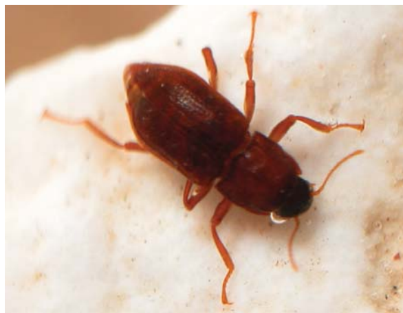
Comal Springs Riffle Beetle