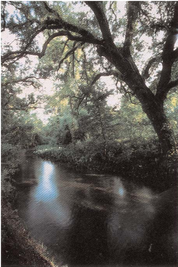
San Marcos River