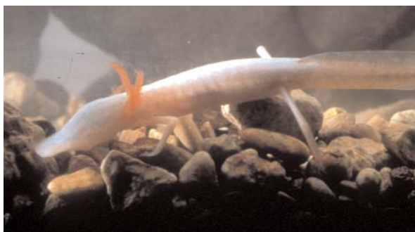
Texas Blind Salamander