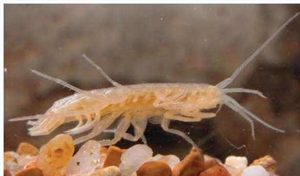
Peck's Cave Amphipod

The adult Comal Springs Riffle Beetle has a narrow body about 2 mm long, and it is reddish-brown in color. The larva has an elongate, tubular body and can be up to 10 mm in length. The Comal Springs riffle beetle is known primarily from Comal Springs where it has been collected from only the primary spring-runs and from up-wellings underlying Landa Lake. A single specimen of this species was taken from the impounded San Marcos Springs, but