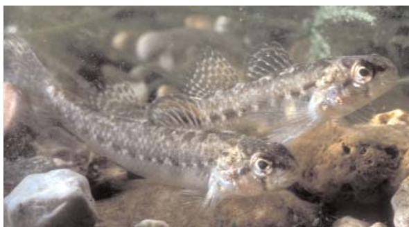
Fountain Darters