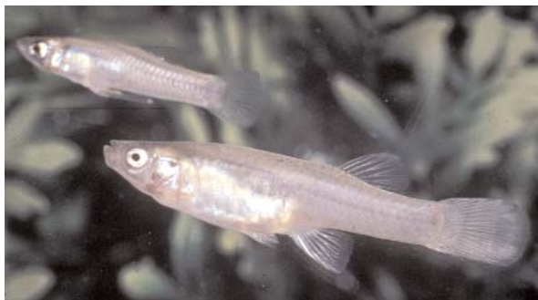
San Marcos Gambusias