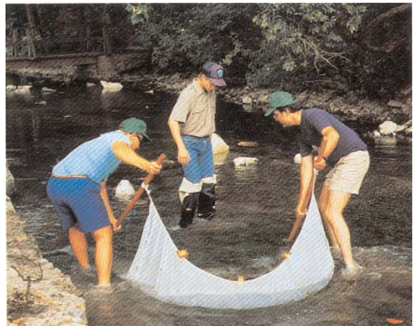
Sampling Fountain Darters in the Comal River