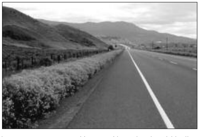
Invasive plants can obstruct sitelines along highways.

Invasive plants destroy the natural beauty of the landscape by replacing native plant communities with an aggressive single species. As well, the burrs, thorns and prickles of some invasive species cause physical discomfort and are a deterrent to recreational use on that land.