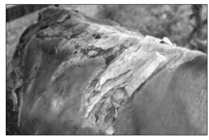
St. John's-wort can cause serious health problems for cattle.

Livestock and wildlife are affected by some invasive plant species in serious ways. St. John's wort increases photosensitization of ungulates, making them more vulnerable to skin burns from solar radiation. Animals that consume hound's-tongue or tansy ragwort can experience cumulative liver damage from the toxic alkaloids in these species, and those that graze on Russian knapweed or yellow starthistle can be inflicted with a fatal nervous disorder. The seed heads of burdock and hound's-tongue can cause serious irritation around the eyes and ears of livestock and wildlife ungulate species when embedded, and can also reduce thermal insulation when matted in the animals' hair.