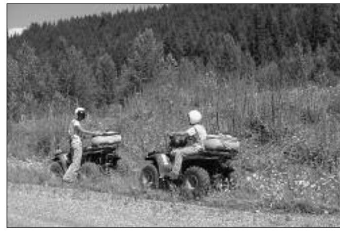
ATV and other recreational users can unknowingly introduce invasive plants.

Invasive plants spread in many ways. People enjoying various land- and water-based recreational activities can unknowingly spread invasive plant seeds, roots and pieces of reproductive foliage. Cyclists and ATV users on grasslands, campers moving among parks, guide outfitters packing in hay for their horses, and boaters launching their boats into a new lake are examples of how recreational users can unknowingly introduce invasive plants.