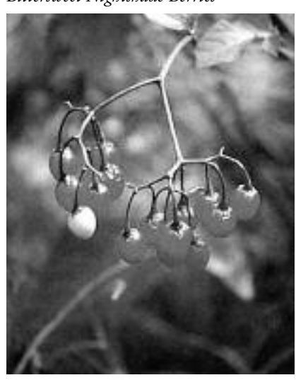
Bittersweet Nightshade Berries

The ecosystem approach is comprehensive; it is based on all of a watershed's biological resources and it considers the economic health of communities within that watershed (US Fish & Wildlife Service 2003).