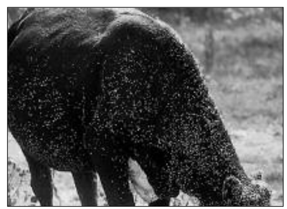
Hound's-tongue is easily spread by burrs that attach themselves to animals.

Invasive plants produce a wide range of detrimental impacts on the agriculture industry. Many act as hosts for insects and crop diseases. They reduce crop quality and market opportunities, and similarly decrease farm income by reducing yields by an average of 10–15 percent. Every year, British Columbian farmers and ranchers lose an estimated $50 million in crop revenue, and then also pay several million dollars more for control measures, such as herbicides and cultivation (BC Ministry of Agriculture, Food and Fisheries 1998). A conservative estimate of the economic impact of invasive plants on Canadian agriculture is over $1 billion annually (R. Cranston, BC Ministry of Agriculture, Food and Fisheries, pers. comm., based on estimates by Swanton et al. 1993).