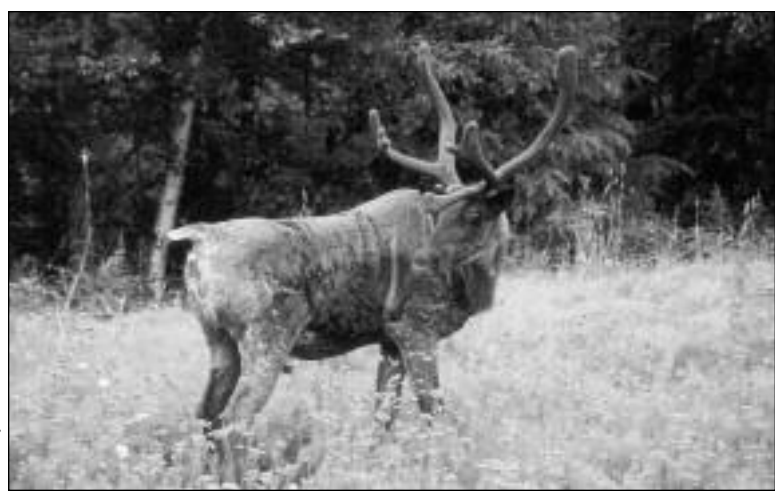
Caribou in field of Yellow Hawkweed.

Throughout this strategy, the term "invasive plant" refers to any invasive alien plant species that has the potential to pose undesirable or detrimental impacts on humans, animals or ecosystems.