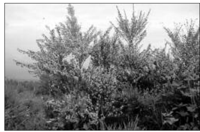
Scotch Broom threatens ecosystems on Vancouver Island.

After habitat loss, invasive species are the second biggest threat to species at risk in British Columbia, including plants and other wildlife. Ecosystems across the province are vulnerable, particularly Interior grasslands and dry forests, and drier coastal ecosystems. Associated riparian and wetland communities in these areas are also susceptible to the threat of invasive plants.