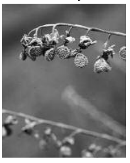
Hound's-tongue burred seeds

Reduce the yield and quality of agricultural crops and natural forage, and the quality and price of marketable livestock.