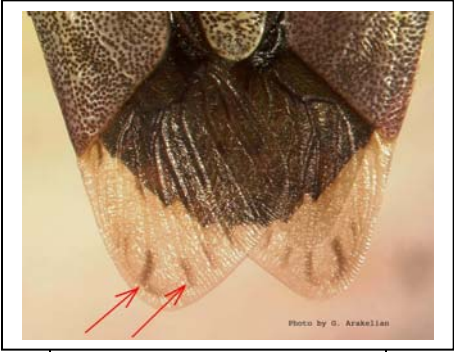
Dark bands on forewings