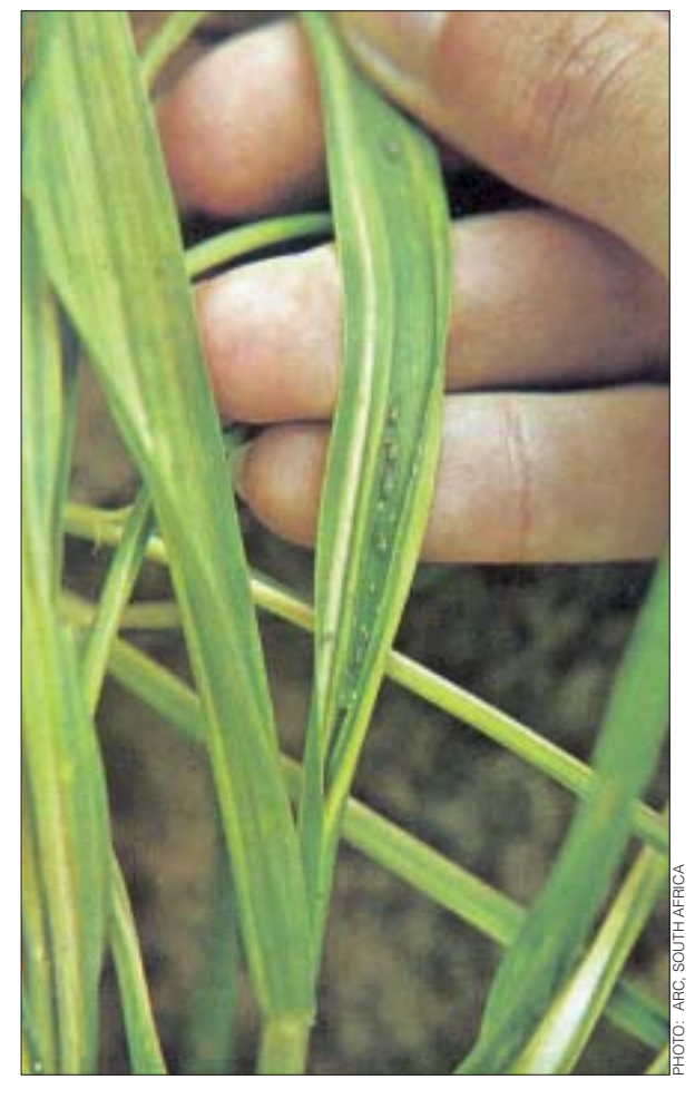
INFESTED WHEAT LEAF UNFOLDED TO SHOW COLONY OF RUSSIAN WHEAT APHID

In the spring, as wheat stems begin to elongate, the aphids move upward to infest the new leaves. Eventually the aphids reach the flag leaf, causing it to roll and "trap" the emerging head and awns. The "trapped" head then curls, resulting in poor pollination. These curled heads resemble heads damaged by 2,4-D.