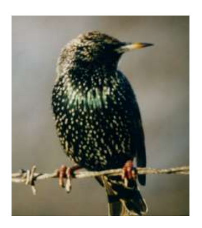
The European Starling