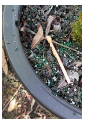
In a pot