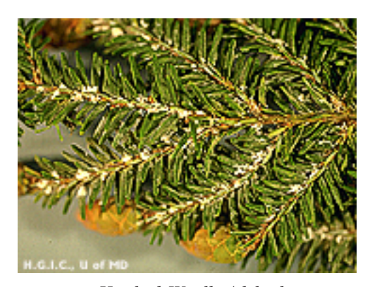
Hemlock Woolly Adelgid

mer. The crawler is the dispersal stage and is spread primarily on the wind. Upon finding a suitable place to feed the crawlers settle, generally on branch terminals at the bases of needles. The