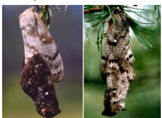
Adult moths mating, female is above male.

There are three subspecies: D. superans superans occurs in Japan, D. superans albolineatus occurs in the Sakhalin and the Kuril Islands, and D. superans sibiricus is continental and widespread.