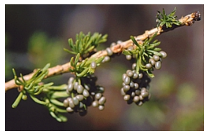
A female lays up to 450 eggs, 0.1" diameter, in clusters or chains on the foliage.

The life cycle of the Siberian moth spans 2 or more calendar years and 3 is typical. It overwinters in the larval stage, coiled-up under the forest litter. The number of larval instars varies from 5 to 8 for males and 6 to 9 for females. Drought, increasing population density, and other factors not well understood cause some of the larvae to have a shorter, 2-calendar-year life cycle. As a result, the adults of two generations emerge simultaneously and the population increases sharply.