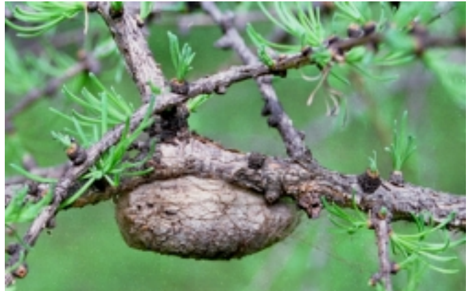
Pupal cocoon (in tree crown).

The life cycle of the Siberian moth spans 2 or more calendar years and 3 is typical. It overwinters in the larval stage, coiled-up under the forest litter. The number of larval instars varies from 5 to 8 for males and 6 to 9 for females. Drought, increasing population density, and other factors not well understood cause some of the larvae to have a shorter, 2-calendar-year life cycle. As a result, the adults of two generations emerge simultaneously and the population increases sharply.