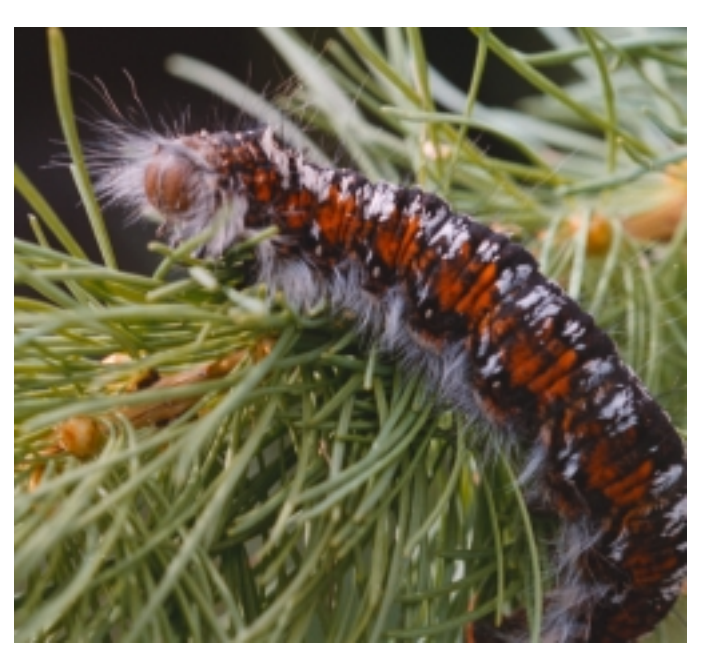
Larva, side view.

Larvae are up to 4 inches long and covered with hair-or scale-like setae that form variable color patterns. The dorsal surface has distinctive silvery, scale-like setae. Reddish setae occur on the sides of the larvae, usually as small spots, but also as a broad, jagged band. Tufts of hairs occur on the first and second thoracic segments. The hairs are irritating to many people. Larvae often arch-up the thoracic segments when disturbed exposing the toxic hairs.