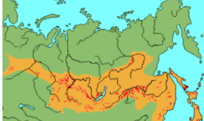
Map of the Siberian moth's range (orange) and areas where outbreaks have occurred (red).

Outbreaks can be suppressed by aerial application of pesticides. Synthetic pyrethroids are used frequently in Siberian Russia and are applied both in the spring and fall. Bacillus thuringiensis (Bt) can also be used in the fall to reduce populations of young larvae.