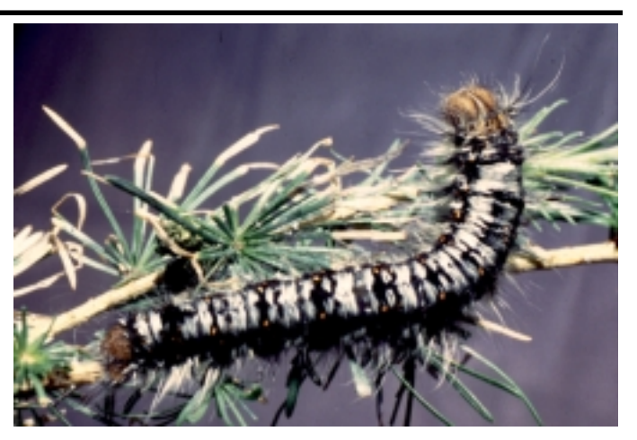
Larva, showing dorsal setae.

Moths fly and lay eggs from the end of June to the beginning of August. Female flight occurs in early evening to midnight, but little is known about mating and flight behavior.