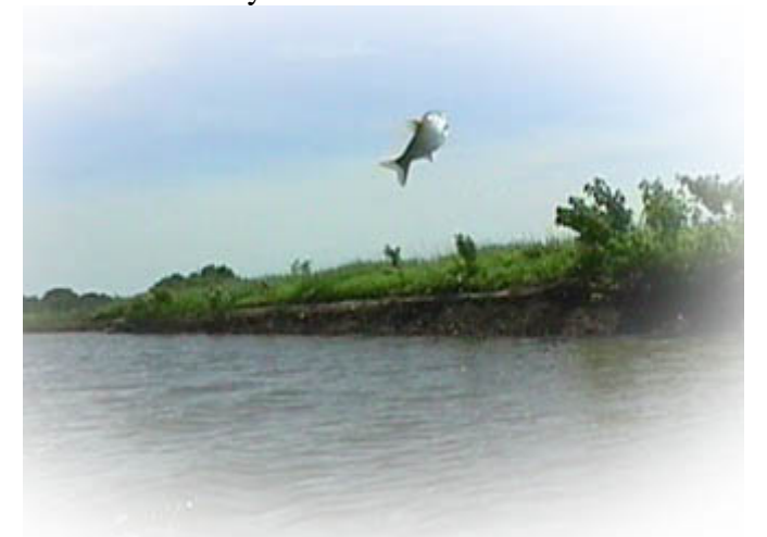
A silver carp, startled by the boat, leaps more than six feet out of the Illinois River.

LIFE CYCLE BIOLOGY AND LIFE HISTORY: Sliver carp are filter feeders that eat phytoplankton, zooplankton, bacteria, detritus and they graze aquatic vegetation. They live in freshwaters that are standing or slow flowing. After 3 years they are mature enough to breed and will breed until their maximum age of 10 years old. Spawning occurs anytime between April and September when the temperature is between 18-20 degrees Celsius. They migrate up stream to breed in groups of 15 to 20. They need water with some current so the eggs and larvae can float downstream. The silver carp swim just below the waters surface and are often disturbed by boat motors and will jump from the water when startled. These "flying fish" can pose a danger to anglers, boaters, and other recreational users. Silver carp have been cultured around the world, and in many countries are relied on heavily as a food source.