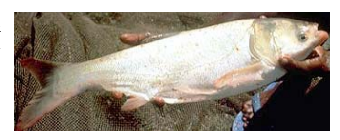
Figure 3. Silver Carp: Image courtesy of The Virtual Aquarium Web site: http://www.cnr.vt.edu/efish/families/silvercarp.html

http://nas.er.usgs.gov/queries/SpFactSheet.asp?speciesID=549