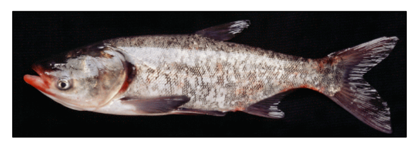
Figure 1. Bighead Carp: Image courtesy of the USGS NAS Web site: http://nas.er.usgs.gov/queries/SpFactSheet.asp?speciesID=551

The bighead carp is a very large deep-bodied, somewhat laterally compressed fish with a very large head (Figure 1). Scales are very tiny,