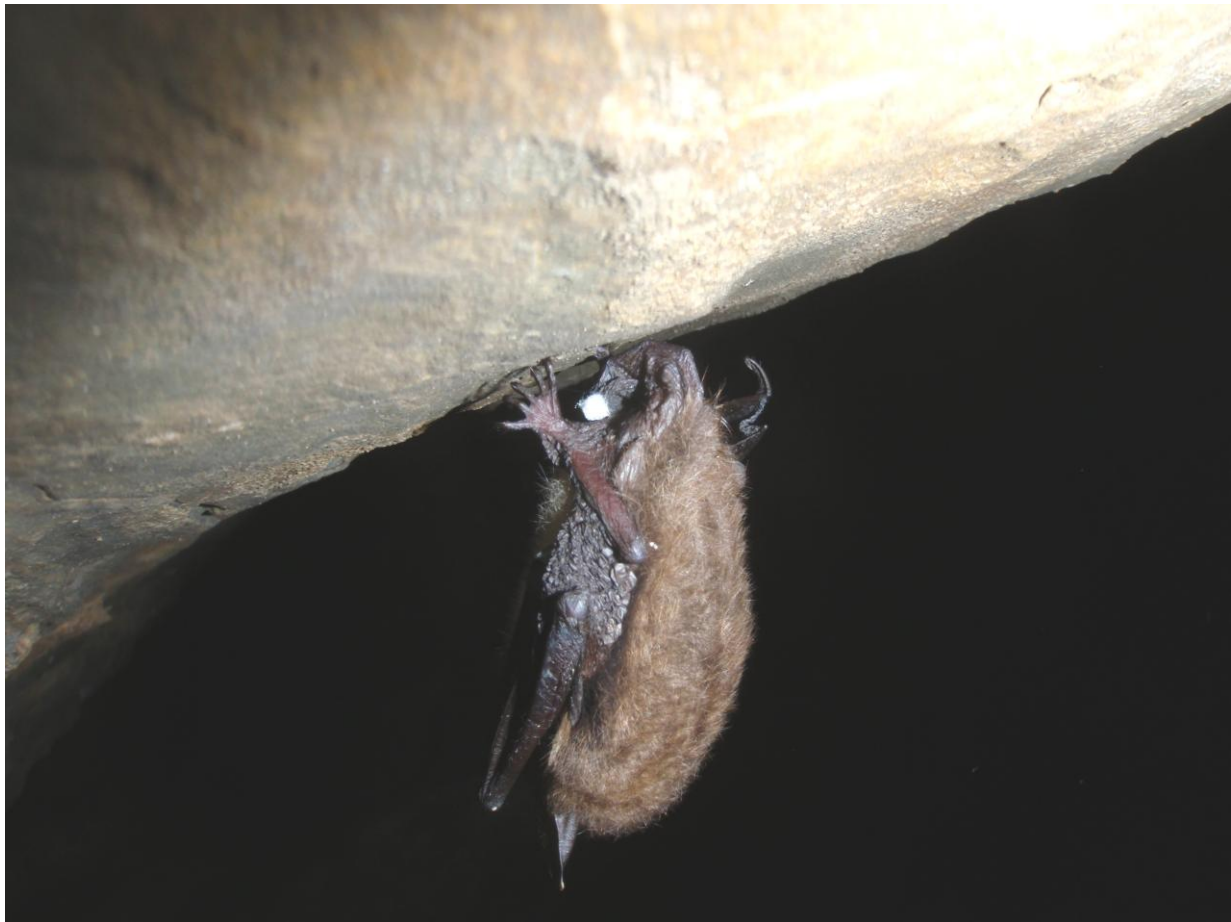
Little brown bat, Myotis lucifugus , with white fungus on tail, Breathing Cave, Bath County, Virginia.