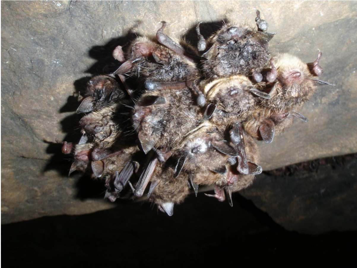
Cluster of little brown bats, Myotis lucifugus , with white-nose syndrome, Breathing Cave, Bath County, Virginia.