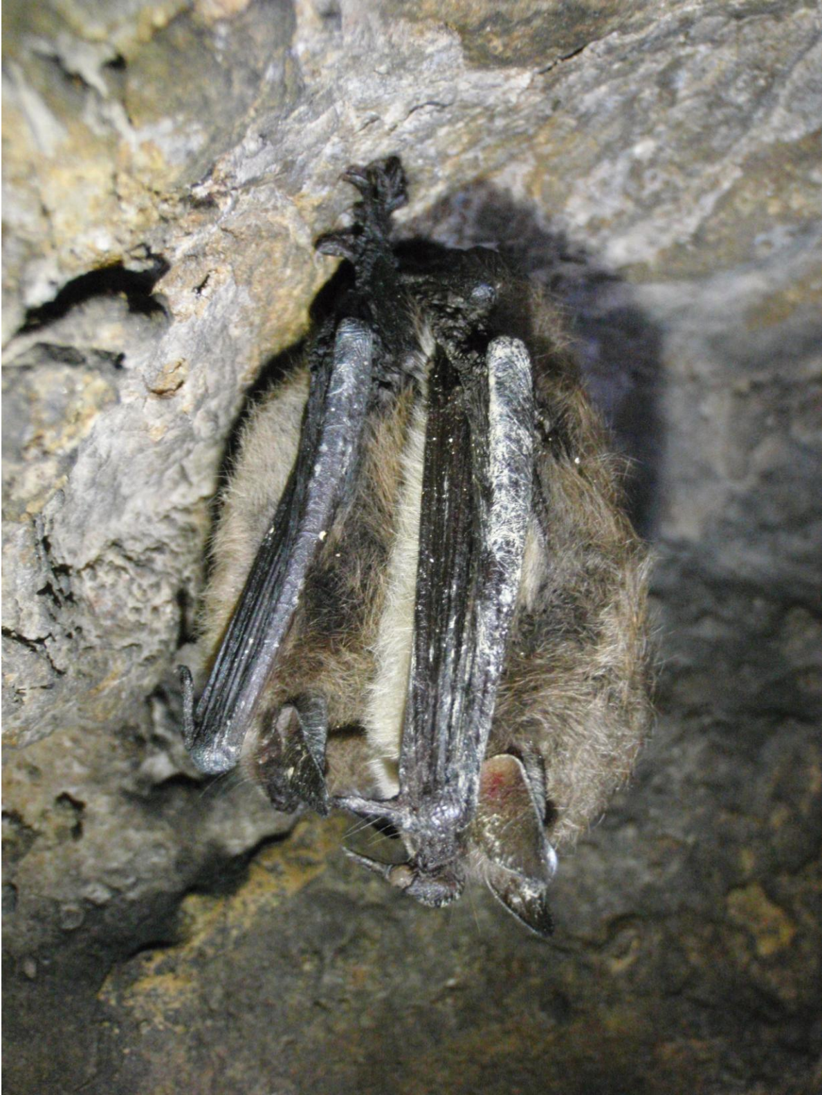
Little brown bat, Myotis lucifugus , with white fungus on wings, Breathing Cave, Bath County, Virginia.