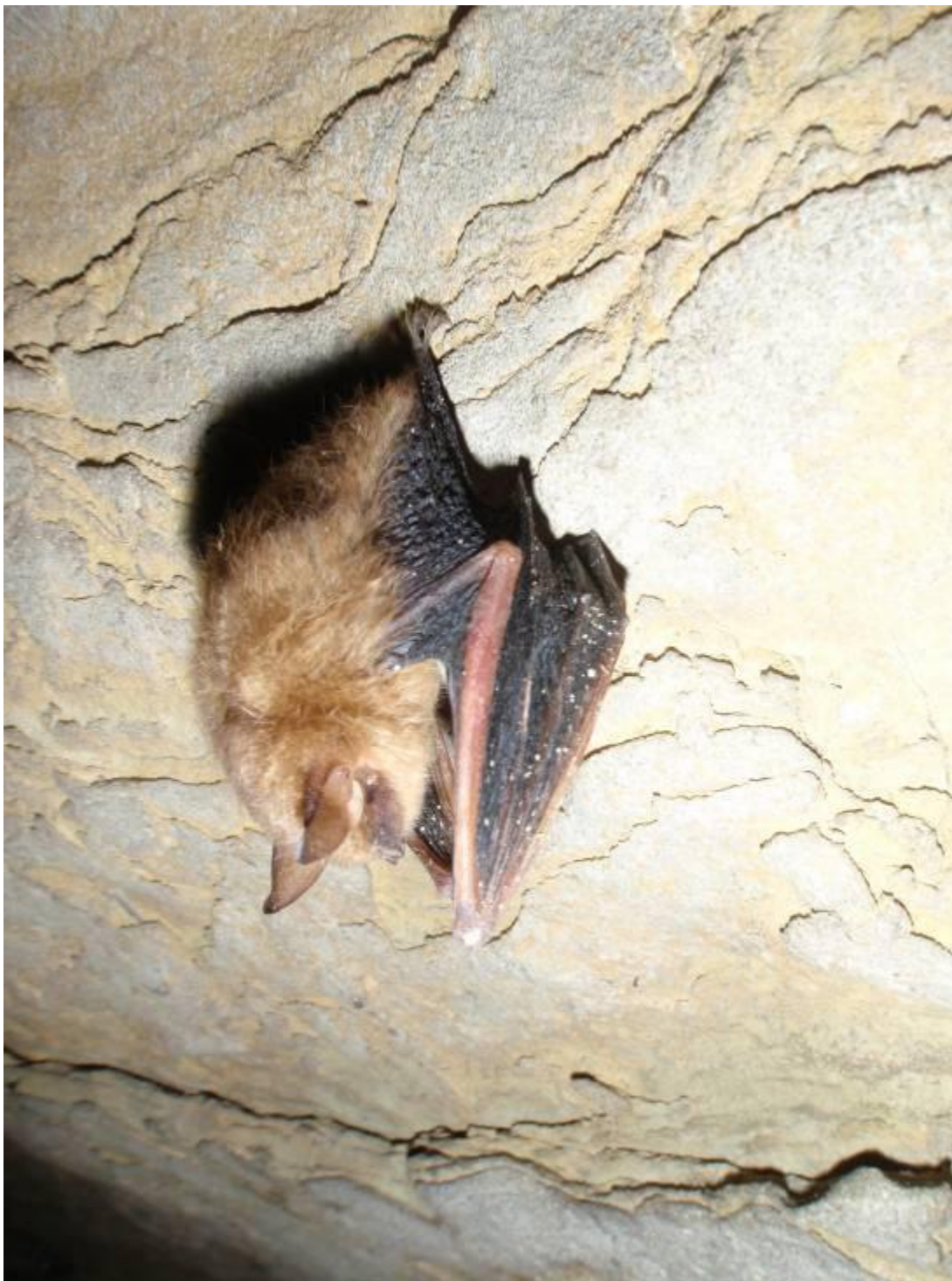
Dead Eastern pipistrelle, Pipistrellus subflavus , with white fungus on wings, Breathing Cave, Bath County, Virginia.