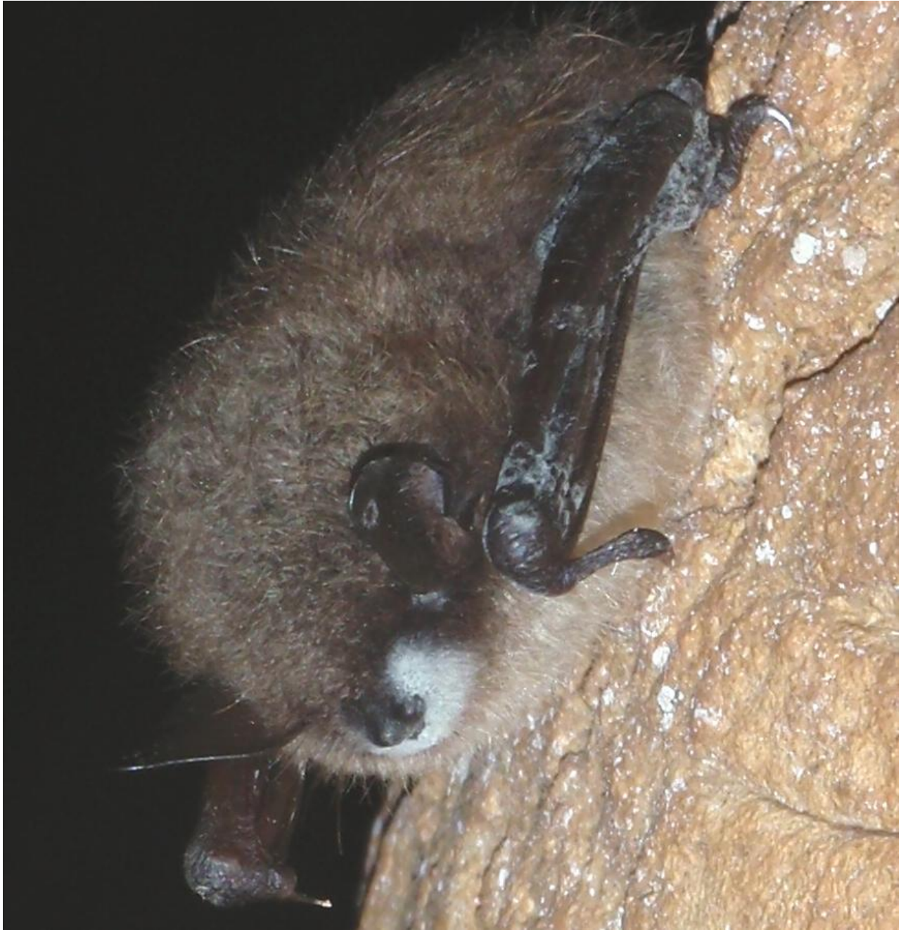
Little brown bat, Myotis lucifugus , with white-nose syndrome, Clover Hollow Cave, Giles County, Virginia.