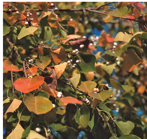
Fall foliage and "popcorn" fruit

Because of its aggressive growth rate, never plant Chinese tallow trees. There are native trees that provide shade and do not harm the environment. Possession of Chinese tallow with the intent to sell, transport or plant is illegal in Florida.