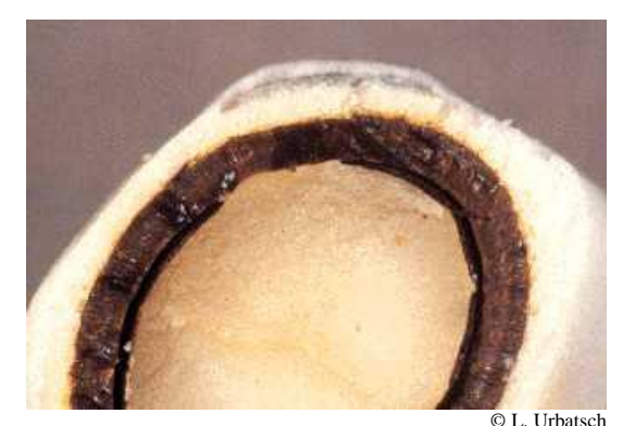
Cross-section of seed showing tallow portion.

To determine its potential to invade and persist in hardwood forests, the shade tolerance of Chinese tallow was compared to American sycamore ( Platanus occidentalis ) and cherrybark oak ( Quercus pagoda ) in a series of experiments (Jones & McLeod 1989). Tallow tree growth was shown to exceed sycamore and oak in shade, and tallow tree and sycamore growth exceeded oak in full sun. Such findings are consistent with observed patterns of tallow tree growth in North America. With its ability to grow rapidly in sunlight or under closed canopies, the species is likely to invade and persist in many of the floodplain forests of the coastal Southeast.