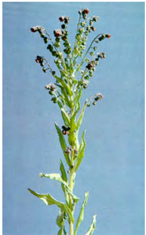
Figure 3. Mature houndstongue plants grow one to four feet tall.

Houndstongue can survive hot, dry summers, as well as cold winters. It is found on a variety of soils from well-drained, relatively coarse, alkaline soils to clay subsoil. It is tolerant of shade and prospers in wetter grasslands. It is found on roadsides, meadows, and disturbed places. Houndstongue has been found in Elko County, Nevada and can quickly spread to other areas of the state.