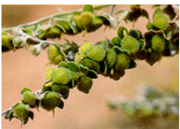
Figure 2. Houndstongue flowers in the second year of growth, producing an abundance of barbed seeds.

Four prickly nutlets are produced from a flower. Each is about 1/3 inch long (Fig. 2). They break apart into single seeds at maturity. The egg-shaped seeds are flat on top, with a scar that runs near the lower surface and a hard spiny husk with barbs. They easily cling to animals and clothing. A plentiful amount of seeds are produced in the second year and germinate from February to May. Seeds can remain viable on the soil surface for up to two years.