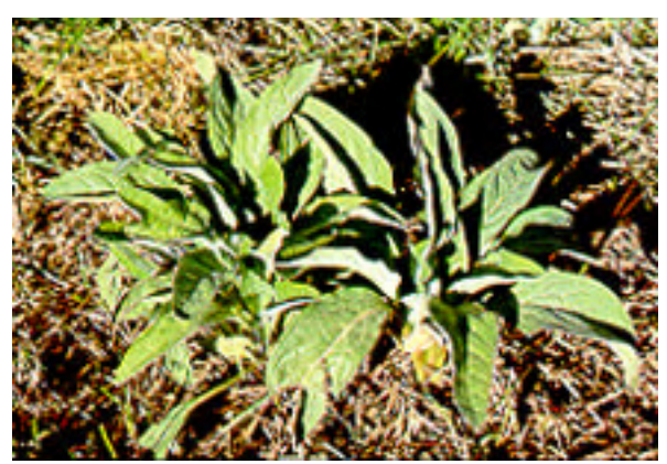
Figure 1. Houndstongue forms rosettes in the first year of growth.

Houndstongue ( Cynoglossum officinale L.) is a biennial introduced to North America from Europe as a contaminant of cereal seed. In addition to being very invasive, this member of the Boraginaceae (Borage) family contains alkaloids that are highly toxic to cattle and horses. Houndstongue displaces native rangeland vegetation by capturing soil resources with its deep, well-anchored taproot, and infests pastures, hay fields, and disturbed areas throughout North America.