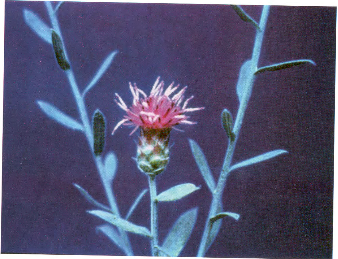
Russian knapweed seedhead