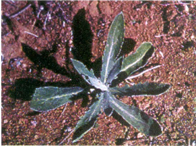
newly emerging Russian knapweed