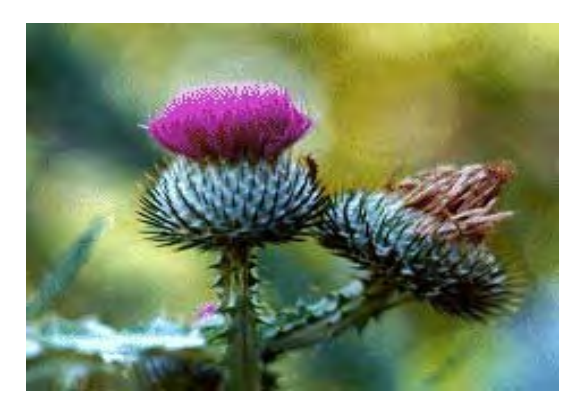
Figure 2. Scotch thistle flower head.

Although scotch thistle prefers disturbed areas with high soil moisture, drier areas do not limit its invasive nature. It commonly invades overgrazed lands, rangeland, pastures, roadsides and construction sites.