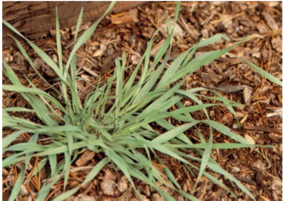
Figure 1.—Downy brome in the vegetative growth stage.