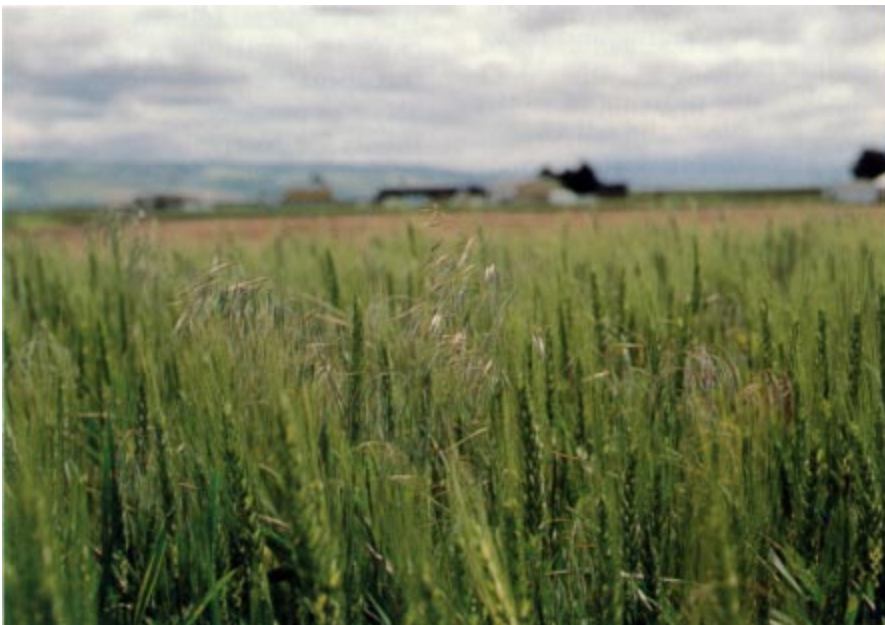
Figure 4.—Mature downy brome panicles in a field of ripening winter wheat.