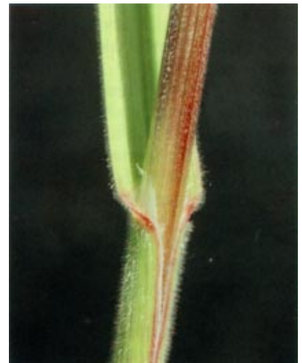
Figure 2.—Magnified view of the collar region of a downy brome culm showing characteristic pubescence.

Downy brome is a major weed problem in winter wheat, perennial grass seed, and alfalfa in much of the Pacific Northwest and Great Plains. Downy brome infestations of 10 and 50 plants per square foot can reduce winter wheat yields by 40 and 92 percent, respectively. Downy brome is especially troublesome in drier production areas where crop rotations are mostly limited to winter wheat followed by a year of summer fallow (winter wheat-summer fallow rotation).