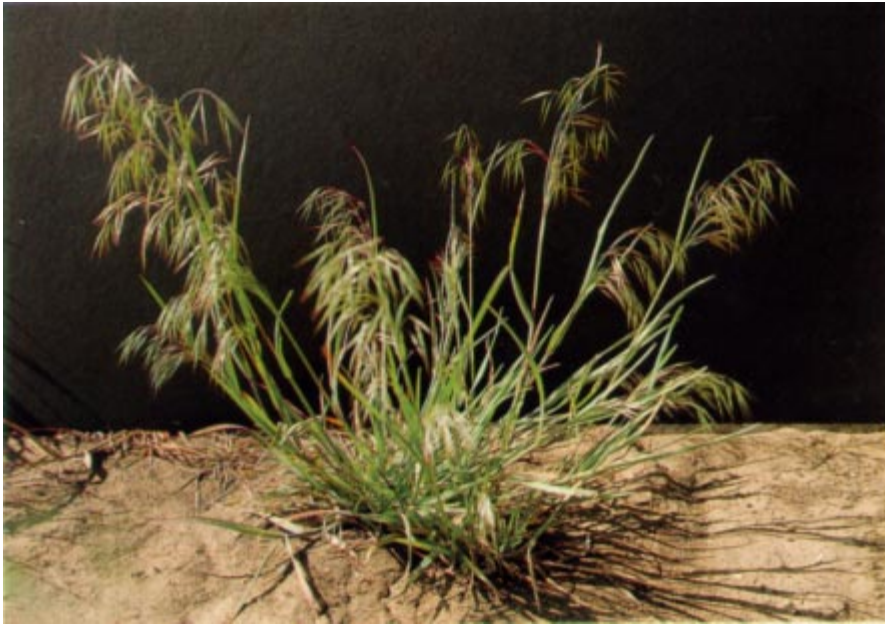
Figure 3.—Mature downy brome plant showing characteristic growth habit.