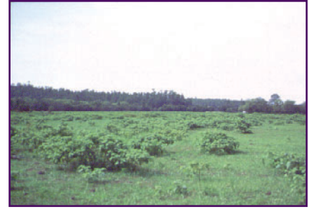
A difficult management problem.