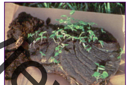
Numerous new plants in the cow patty.

and the hairless, round fruit may be \frac{3}{4} to 1\frac{1}{4} inches in diameter. Flowers and fruit are produced throughout the growing season. Immature fruit resemble tiny watermelons with green and white mottled coloration. Mature fruit are yellow with a leathery skin surrounding a thin layer of pale green pulp. Each fruit may contain 200 to 400 flattened reddish-brown seeds covered by a sticky