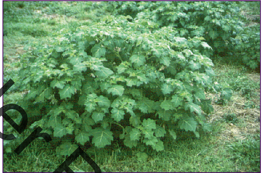
Individual tropical soda apple plant.

Tropical soda apple is a perennial shrub in the Solanaceae plant family. This plant can grow 3 to 6 feet tall and produce a network of underground roots. The stems and leaves are hairy and the leaf margins are divided into broad lobes. The leaves may be up to 8 inches long and up to 6 inches wide. The leaves, stems, flower stalks, and flower bases (calyxes) are covered with white to yellow spines of different lengths (up to \frac{3}{4} inch long). Tropical soda apple produces white flowers with yellow centers (stamens),