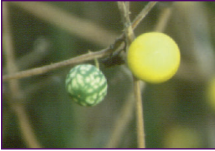
Mature and immature fruit.

90 percent. The foliage of this pest plant is unpalatable to livestock. However, livestock, deer, raccoons, and other wildlife eat the mature fruit of this pest and spread the seed in their feces. Scarification of the seeds by the digestive system of these animals promotes the germination of seed in their feces. Once established in a new location, this pest can reproduce by seed or root fragments.