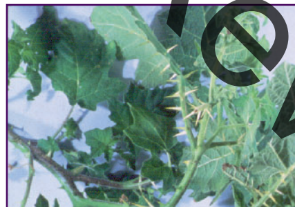
Yellow-white spines of different lengths on stems and leaves.