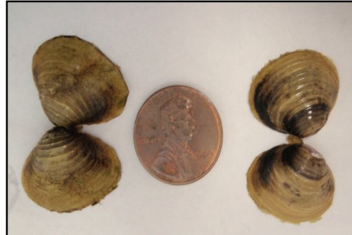
Asian clam size relative to a penny