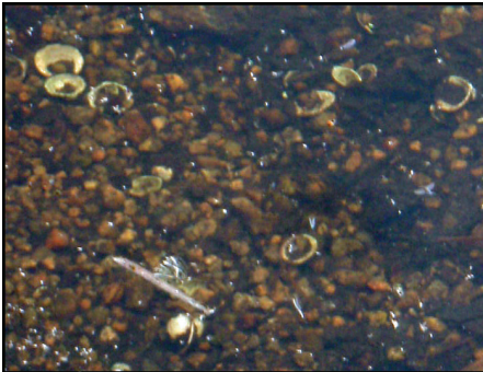
Asian clam shells on lake bottom