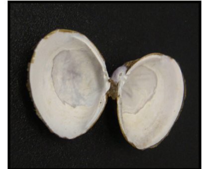
Interior of Asian clam