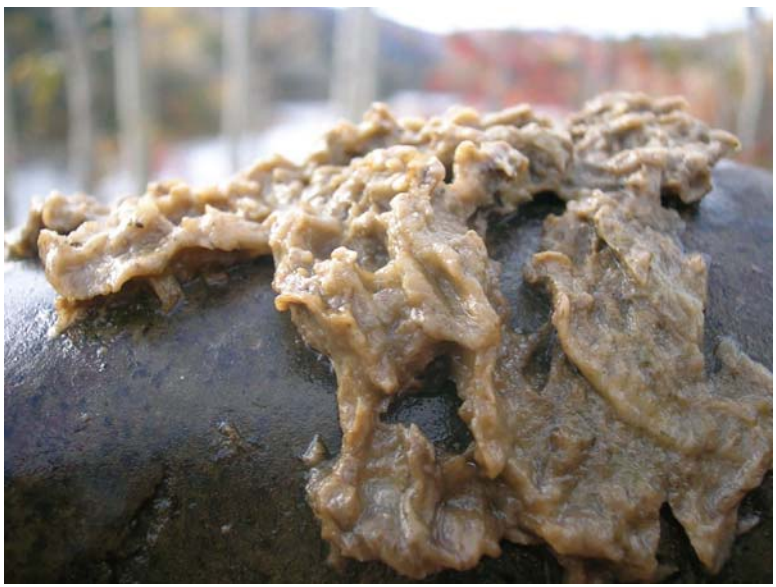
Mats of Didymosphenia geminata on a stone collected in the Matapédia River, in Portes de l'Enfer. Source: Matapédia River Watershed Council (CBVRM), October 2006.

It has been suggested that the most important potential impact of didymo that has been studied may be the impact to pH during midday, at biomass levels as high as those observed in New Zealand. Cumulative effects of elevated pH levels could impact organisms sensitive to this change.