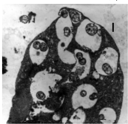
Figure 1. Ultrathin Section of CHSE-214 Cells Showing P. salmonis SLGO-94 within Membrane-Bound Cytoplasmic Vacuoles