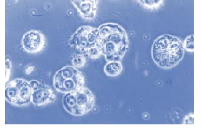
Figure 2. Phase-Contrast Micrograph of C. shasta Trophozoites

Northwest was increased, the virus was also detected in lesions on Pacific cod and herring. Molecular studies suggest that this strain is not of European origin and that Pacific herring may be its natural host. Although the Pacific isolate of VHSV is relatively avirulent for salmonids, this virus is highly virulent in Europe, where much effort is directed toward developing appropriate control measures.