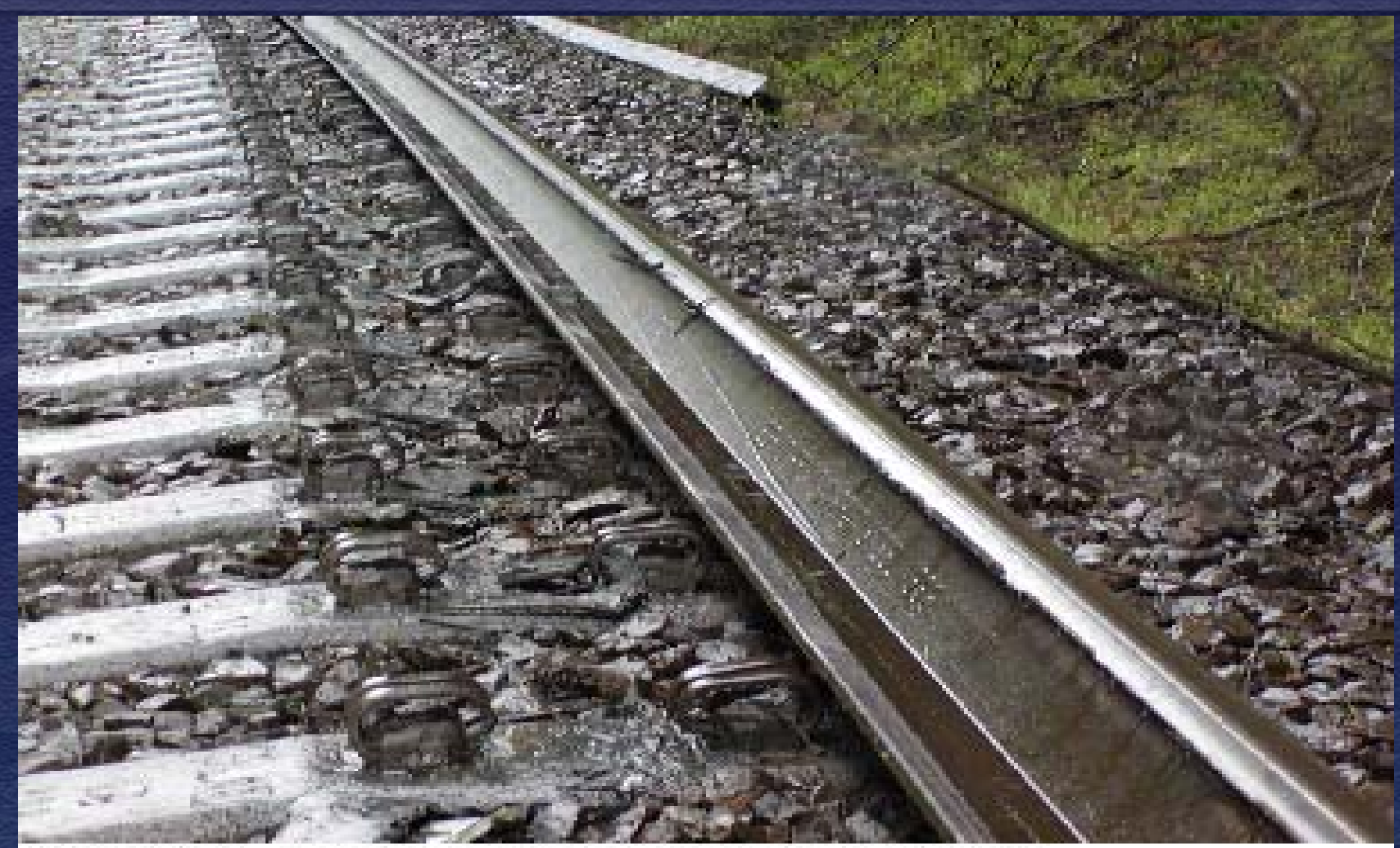
Appendix C - Photo of area with concrete tie abrasion