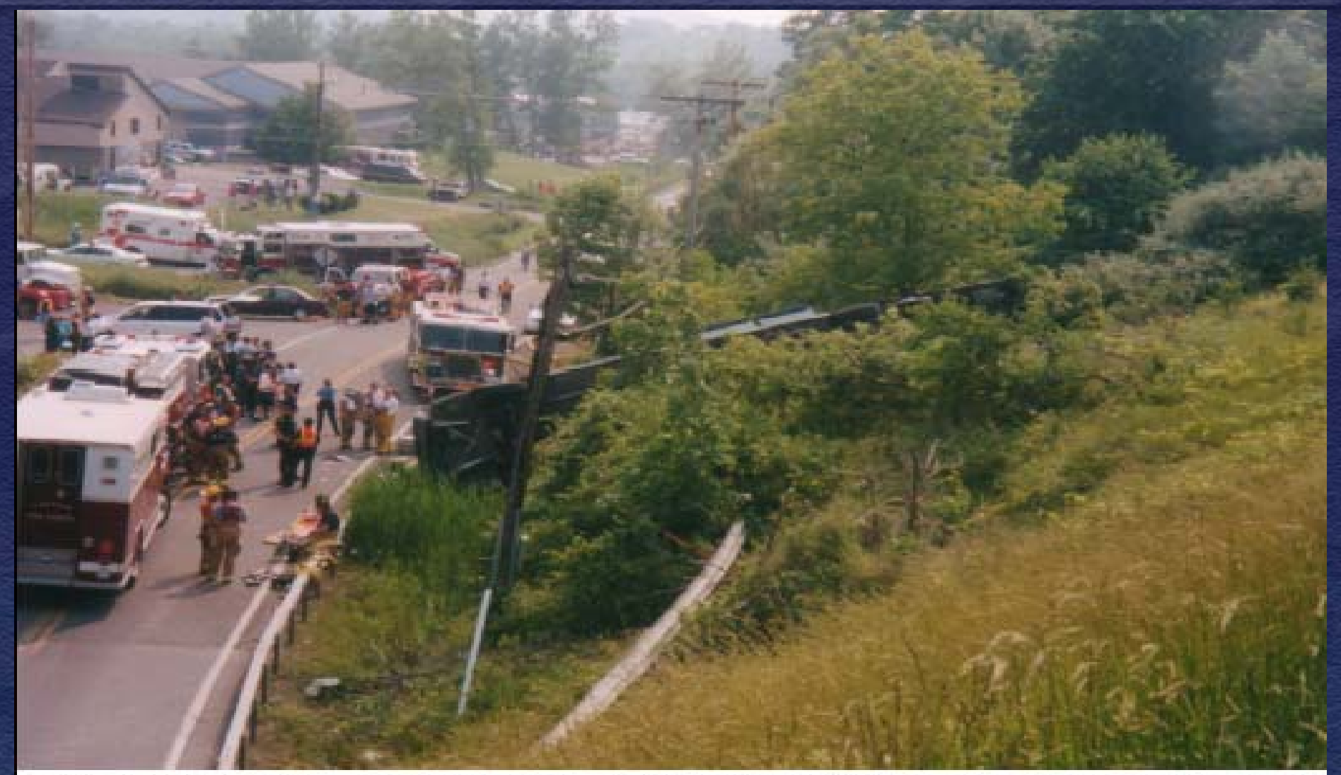
HWY Photo #16 - Final Rest Position of Motorcoach on Embankment of Acceleration Ramp